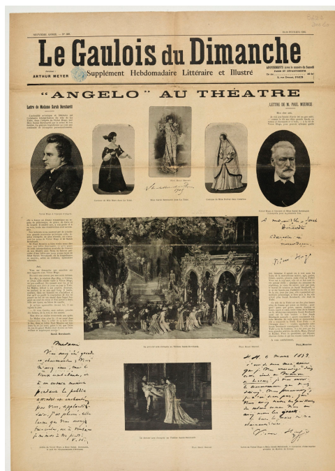
Letter from Paul Meurice, in Le Gaulois du Dimanche , 1905. URL: https://www.parismuseescollections.paris.fr/fr/maison-de-victor-hugo/oeuvres/angelo-au-theatre#infos-principales

Ce rôle de la Tisbé a eu du bonheur ; il a été joué par les trois grandes actrices du siècle, Mars, Dorval et Rachel. Voici la quatrième, qui dépasse chacune d’elles, et qui les résume toutes trois !