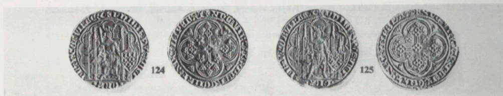
Figure 1 An illustration of a sale catalog.