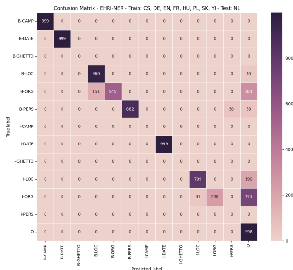
Figure 2: Evaluation of XLM-R on the nl subset, when fine-tuned on all languages except nl, by entity type (experiment 2.1, Section 5.2).

score of above or equal to 50%. The Organization entity and the domain-specific entities Date, Camp, and Ghettos are all under 10% F1 score, the latter having an F1 score of 0. As depicted in Fig. 3, the model mainly misclassified entities as non-entity tokens, which is a common problem in NER (Luthra et al., 2023).