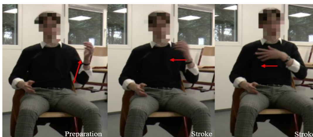
Figure 1. Gesture co-occurring with “ Il passe à côté ” (‘He passes by’) (FR5, ME31) 7