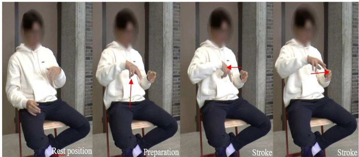
Figure 2. Gesture co-occurring 8 with “Dan loopt de kat efkes te ijsberen voor de kooi” (‘Then the cat is pacing back and forth in front of the cage’) (DU4, ME26) 9