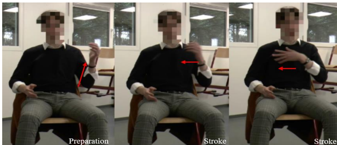
Figure 1. Gesture co-occurring with “ Il passe à côté ” (‘He passes by’) (FR5, ME31) 7 Photo courtesy Christina Piot. Reproduced with permission.