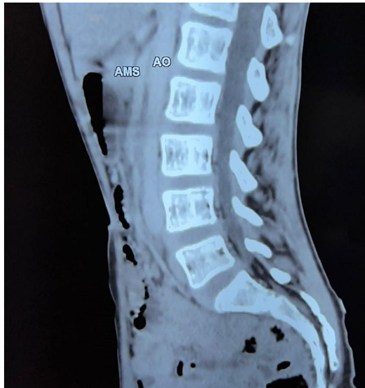
Figure 2: Abdominal angioscan: the acute angle between the aorta and superior mesenteric artery, measured at 15°