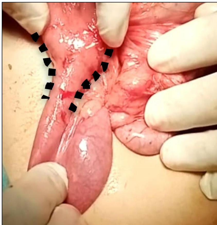
Figure 4: Operative view showing the disparity in caliber at D3; after the duodeno-jejunal angle had been decreased in relation to the clamp

the duodeno-jejunal angle by positioning the jejunum to the right of the AMS after sectioning Treitz's muscle using Strong's technique (Figure 4), which removed the vascular obstacle.