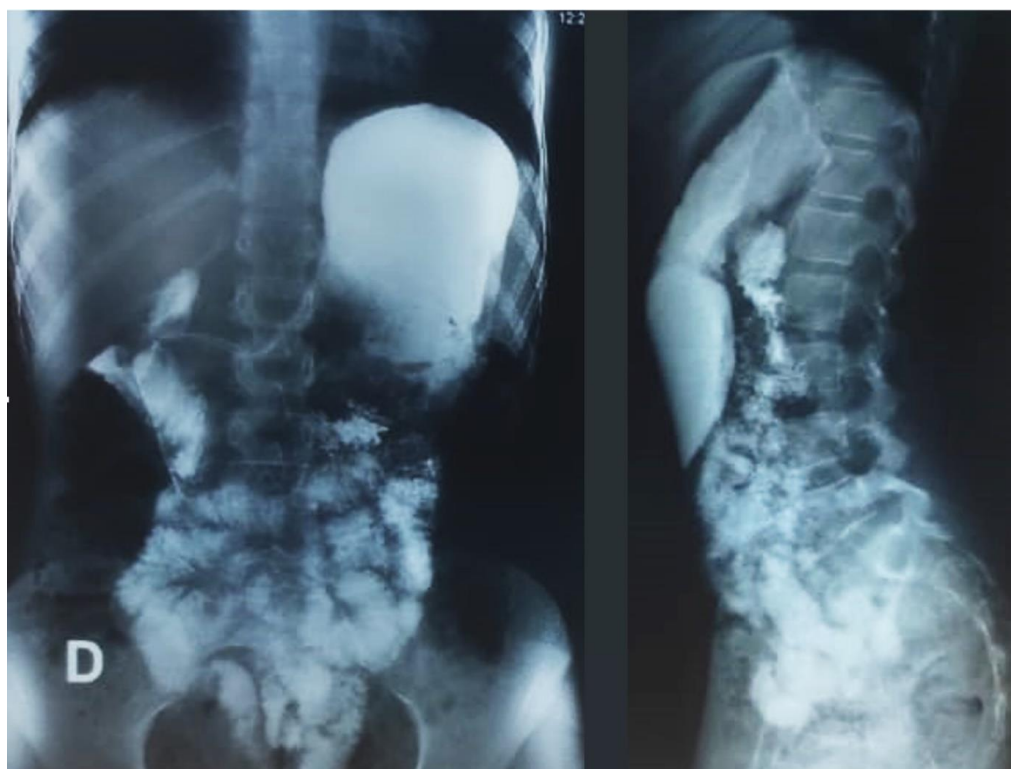
Figure 5: Control Oeso-gastro-duodenal transit, X-ray: good intestinal permeability