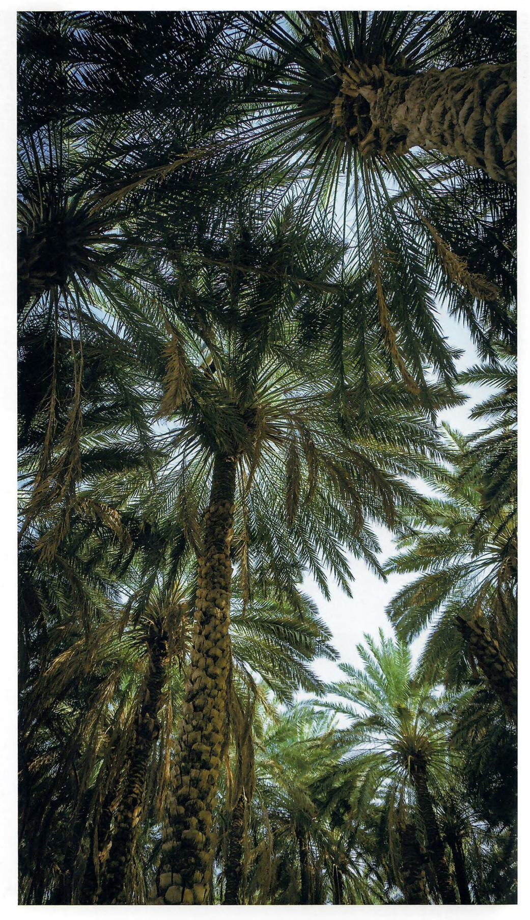
Fig. 10. Canopy of date palms ( Phoenix dactylifera sp.) in a garden of the old AlUIa palm grove, 2020.

The project then focused on developing a comprehensive understanding of how plants function in interaction with the soil's microorganisms. The former developed a network of several kilometres of roots per square metre, while the latter formed networks of microscopic filaments that can reach 200 m per gram of soil. And it is often the case that roots and filaments help each other: the fungus exploits the soil in exchange for sugars from the plant. That is how the Terfezia species, commonly known as desert truffles and much appreciated by food lovers, came into being at AIUIa. Understanding how plants function at AIUIa has provided indicators for sustainable management and the tools for ecological restoration. Finally, the SoFunLand team, in consultation with