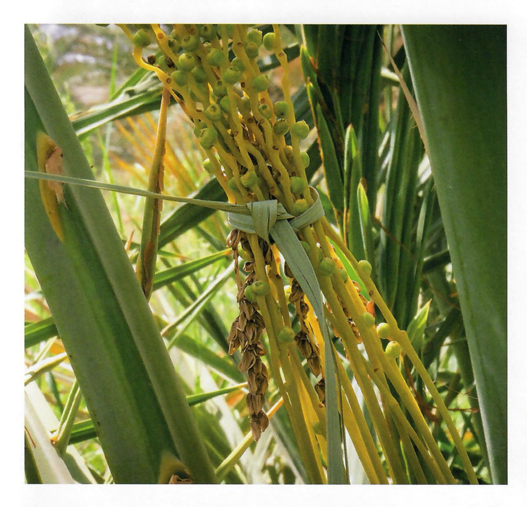
Fig. 14. Pollination of the female date palm: the strand (spikelet) of a male flower

(browner in colour) is attached by the grower to the female flower that will soon form the date cluster, 2020.