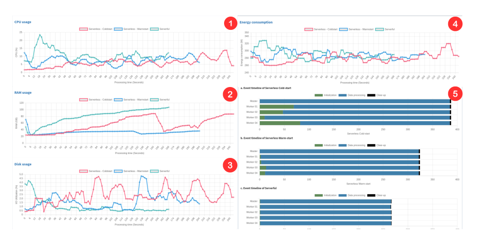
Fig. 2: GUESS monitoring system for visualization

In our demonstration, we use the TPC-H benchmark dataset to evaluate the performance and energy consumption of the Spark application in Serverless and Serverful environments. To visualize the demo result in more detail, we have posted a short demo video and some sample data on GitHub<sup>2</sup> for access.