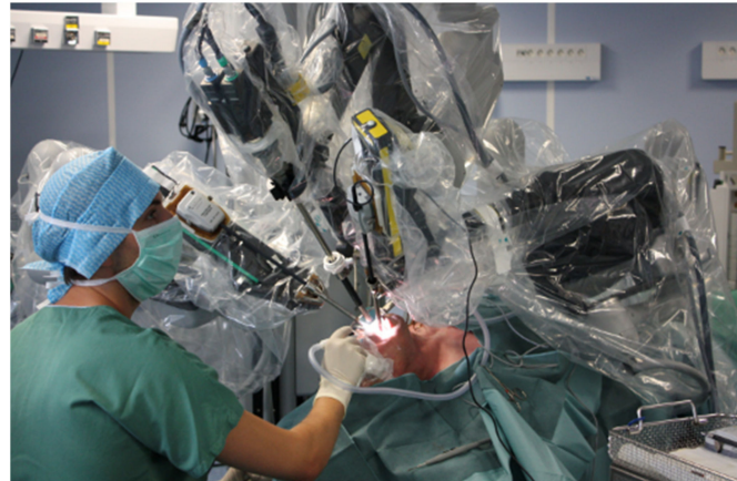
Figure 1. Robot arms introduced transorally during oropharynx surgery.

at 122 months, and the median survival time was 19 months (with a range of from 7 to 122 months). On top of that, in White et al. [9], there was a statistically significant difference in the two-year overall survival rates between the TORS approach and open surgical approach (74% vs. 43%). This shows that such a procedure can be used as a safe, effective, and feasible approach to salvage surgeries, as benefits can be observed.