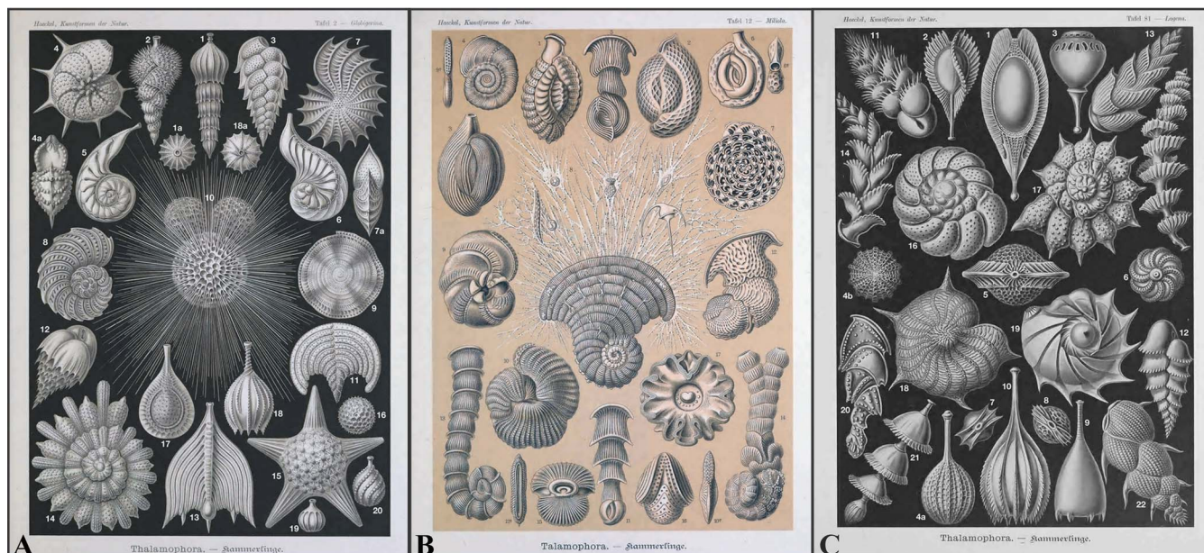
FIGURE 1. The three foram plates in Haeckel's Art Forms : A) plate 2, B) plate 12, and C) plate 81. The centerpiece in plate 12 (B) is a live Peneroplis planata (now known as P. planatus ) with extended pseudopods under recognizable prey items of the marine plankton. Remarkably, it is the only living foram depicted in the three plates, and among all the plates in Art Forms , one of but two showing an organism with its prey. Figure numbers, absent from the original black background plates, have been added. The names of the species shown, by Haeckel, and as currently recognized, are given in the Appendix. The two species Haeckel presented as new species, only recently recognized in WoRMS, appear in the lower left corner ( Vertebralina catena ) and the lower right corner ( V. furcata ) of plate 12 (B).

(1798), and it is also notoriously variable in morphology (e.g., Langer et al., 2009). In contrast, the last foram plate, plate 81, was published among the last two issues in 1904, and it contains illustrations of species first described and illustrated only shortly before (i.e., Brady, 1884; Millett, 1901), thus providing examples of source illustrations to compare with those in Haeckel's plate 81.