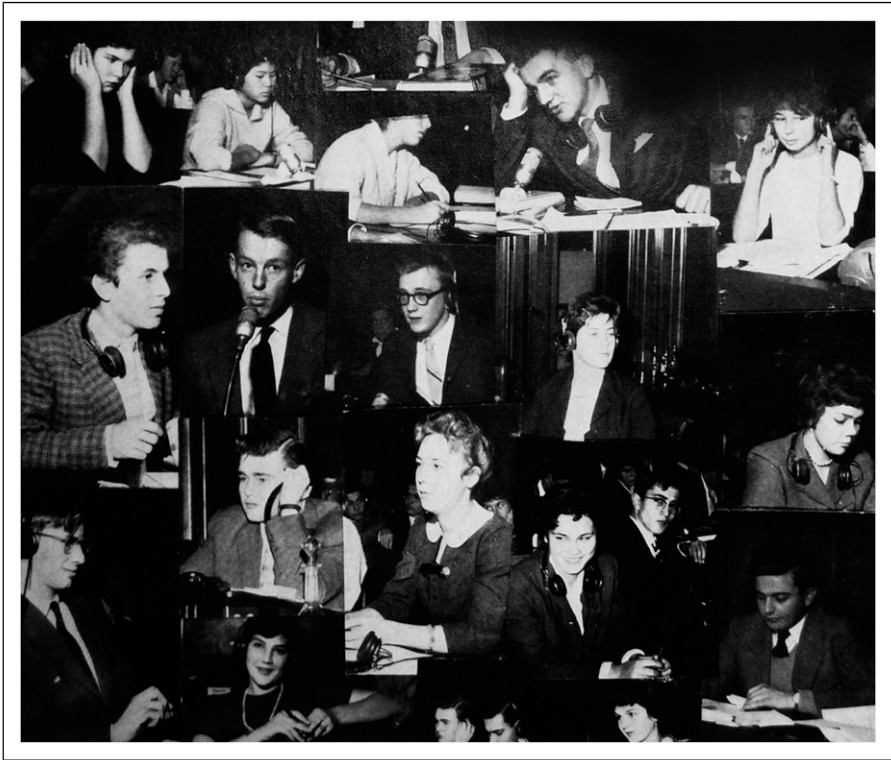
Figure 2. Collage of students photographed at the SUN in 1959 and published in the Ecolint Yearbook the same year.