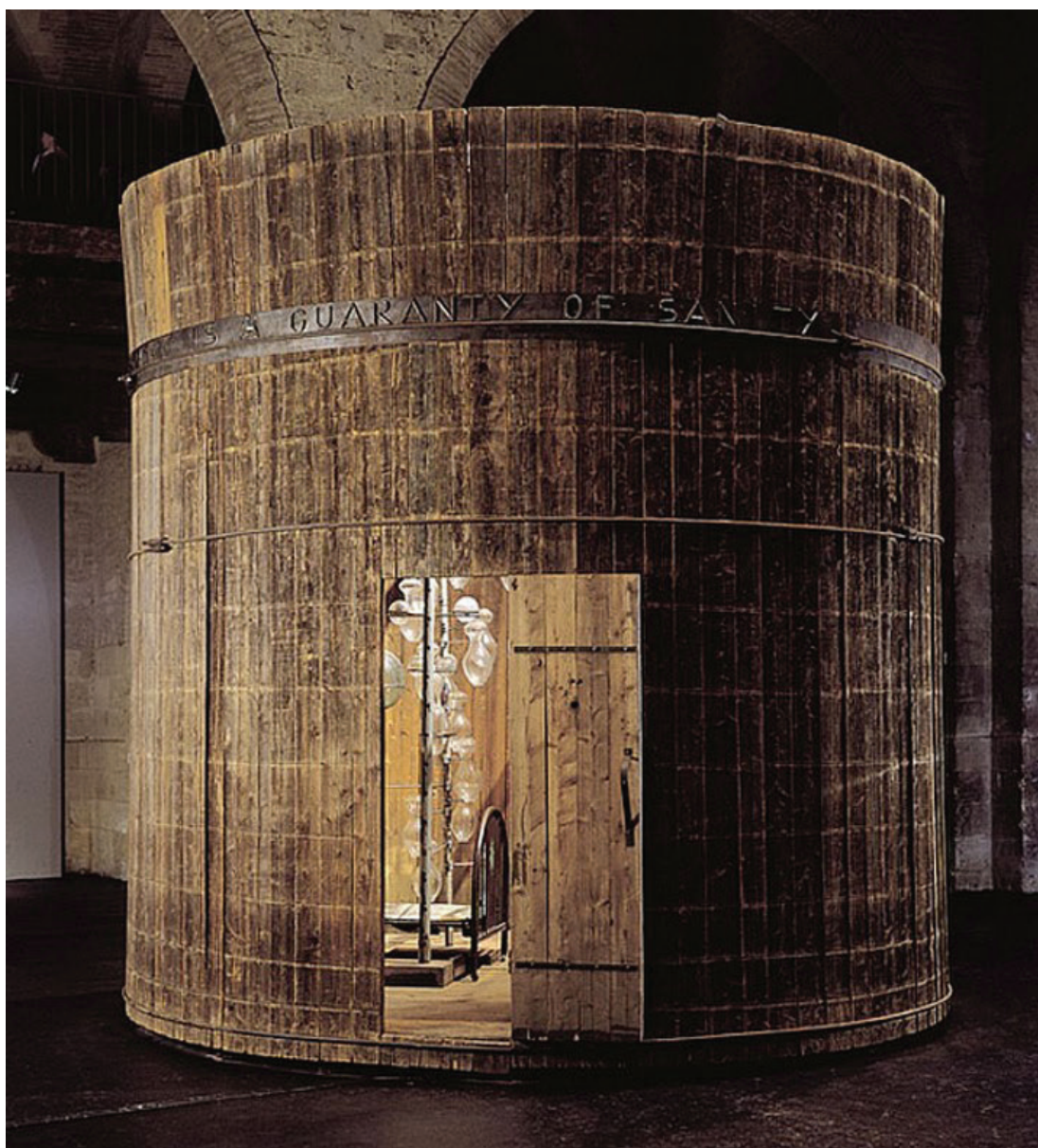
Figure 2 - Cell, Louise Bourgeois.

After a long period working on "housewives," Louise Bourgeois created "Cells," installations exhibited at the Venice Biennale of Contemporary Art in 1993. Cells are enclosures constructed from a variety of scavenged materials, such as wire mesh and steel frames, old doors and windows, pieces of furniture, objects, sculptures, and sometimes fragmented body parts. The doors and windows that offer no way in or out create a feeling of confinement before the spectator's eyes, and the insertion of mirrors inside the cell reinforces the obligation to perceive and come to terms with one's