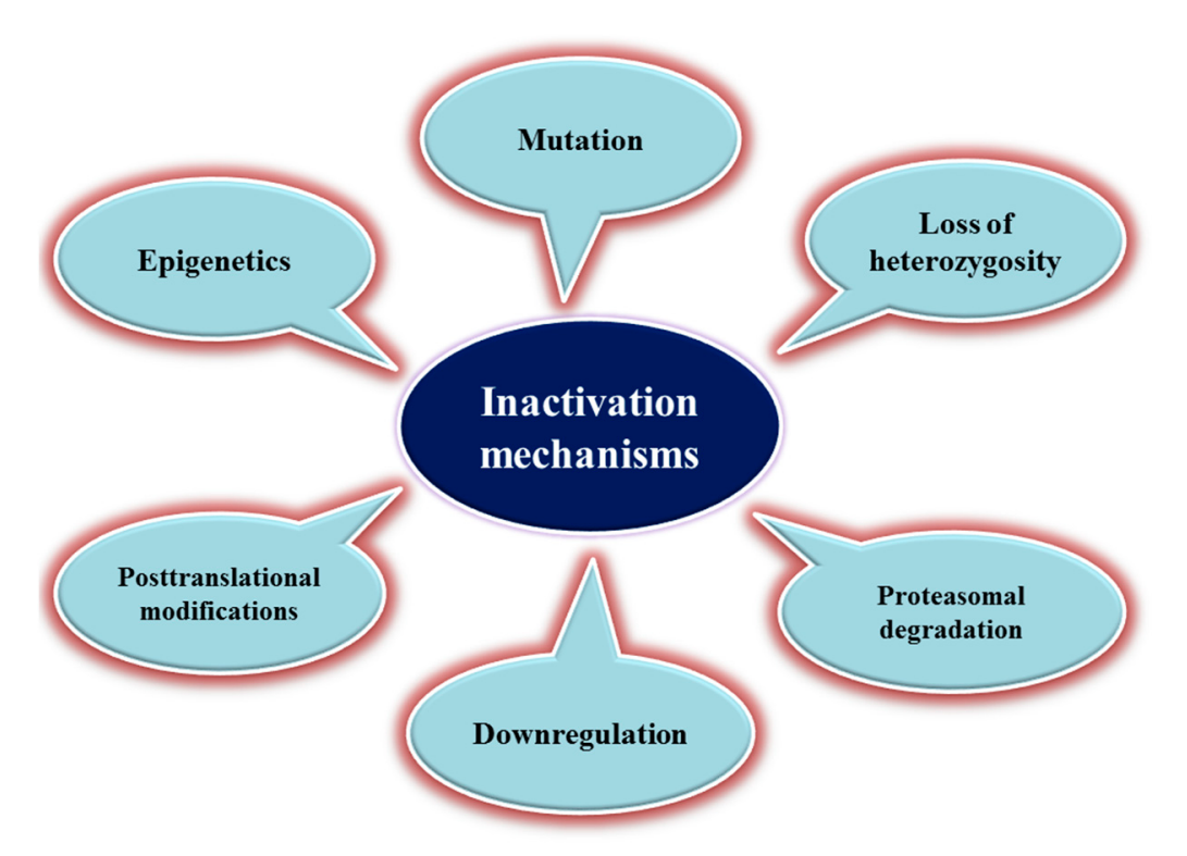
Figure 1. The different mechanisms of tumor-suppressor gene inactivation.

cysteine residue in the active site of PTEN [73]. Figure 1 shows some common mechanisms of TSG inactivation in cancer.