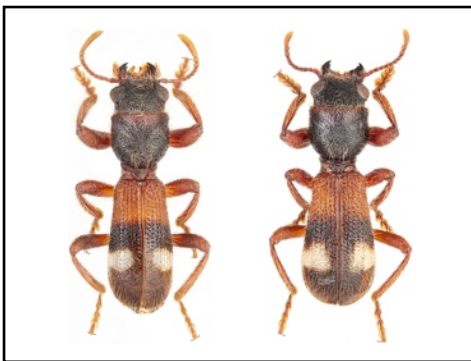
Illustration de la couverture :

Phloiocopus bimaculatus sp. n. , a new apterous species from Somalia (Coleoptera, Cleridae, Clerinae). Roland Gerstmeier . . . . . 1 – 3