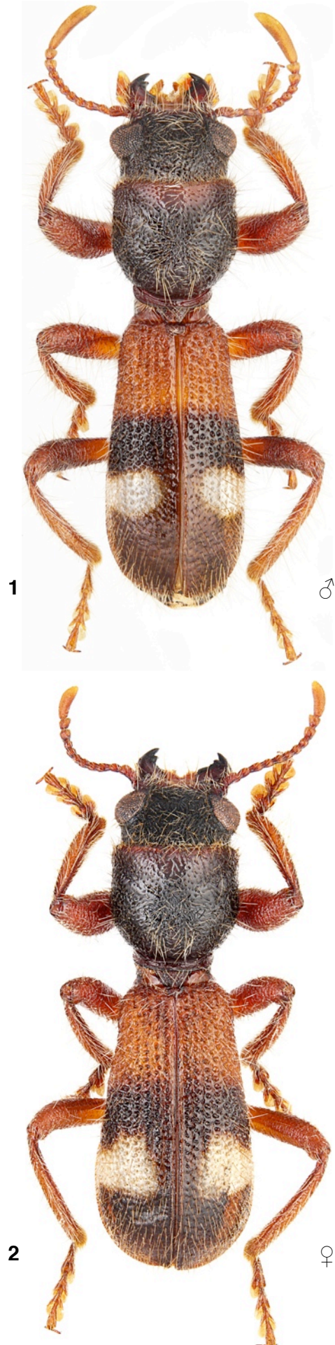
Fig. 1-2. Phloiocopus bimaculatus sp. n. 1. Male. 2. Female.