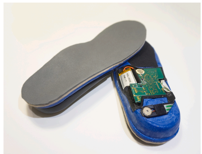
Fig. 1. Vibrating shoe insoles.

Participants attended the Gait Laboratory at The University of Queensland on two separate occasions (2-h/occasion) to complete assessments wearing vibrating and non-vibrating insoles (one insole/occasion, randomised). The two testing sessions took place over a 14-day period, at the same time of day, with at least one day off between sessions. This washout period was used to minimise cross-over, as any prolonged or latent effects of the vibration stimuli (for participants randomised to the vibrating insoles first) could have contaminated the control condition, if assessed within the same session/day. The insole randomisation schedule was determined and managed by a research assistant who was only responsible for administering the insoles during testing sessions. All other investigators involved in data acquisition, processing and analysis were blind to the conditions. As it was not possible to blind participants to the perceptible vibrations, the full aims of the study were concealed. Participants were informed that the study aimed to investigate the effects of different insoles on balance and gait; it