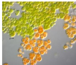
Figure 2: Sphaerocystis sp. cells undergo a stress period of azote deficiency and high light, resulting in a color shift from green to reddish-orange when observed under a microscope (X400).