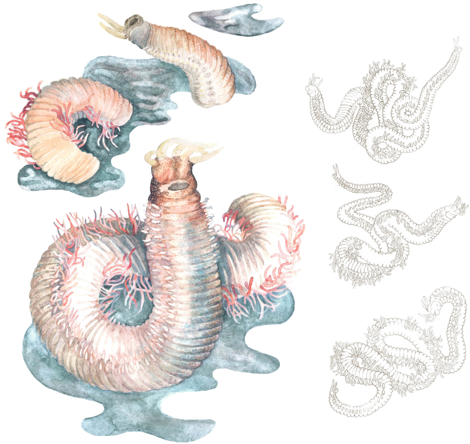
Figure 1. Artistic representation of Marphysa victori Lavesque, Daffe, Bonifácio & Hutchings, 2017, Watercolour from Lisa Miroglio © .

(Guérin, 1990). However, F. enigmaticus , after being considered as an Australian species, is now thought to be native from France (Styan et al. 2017).