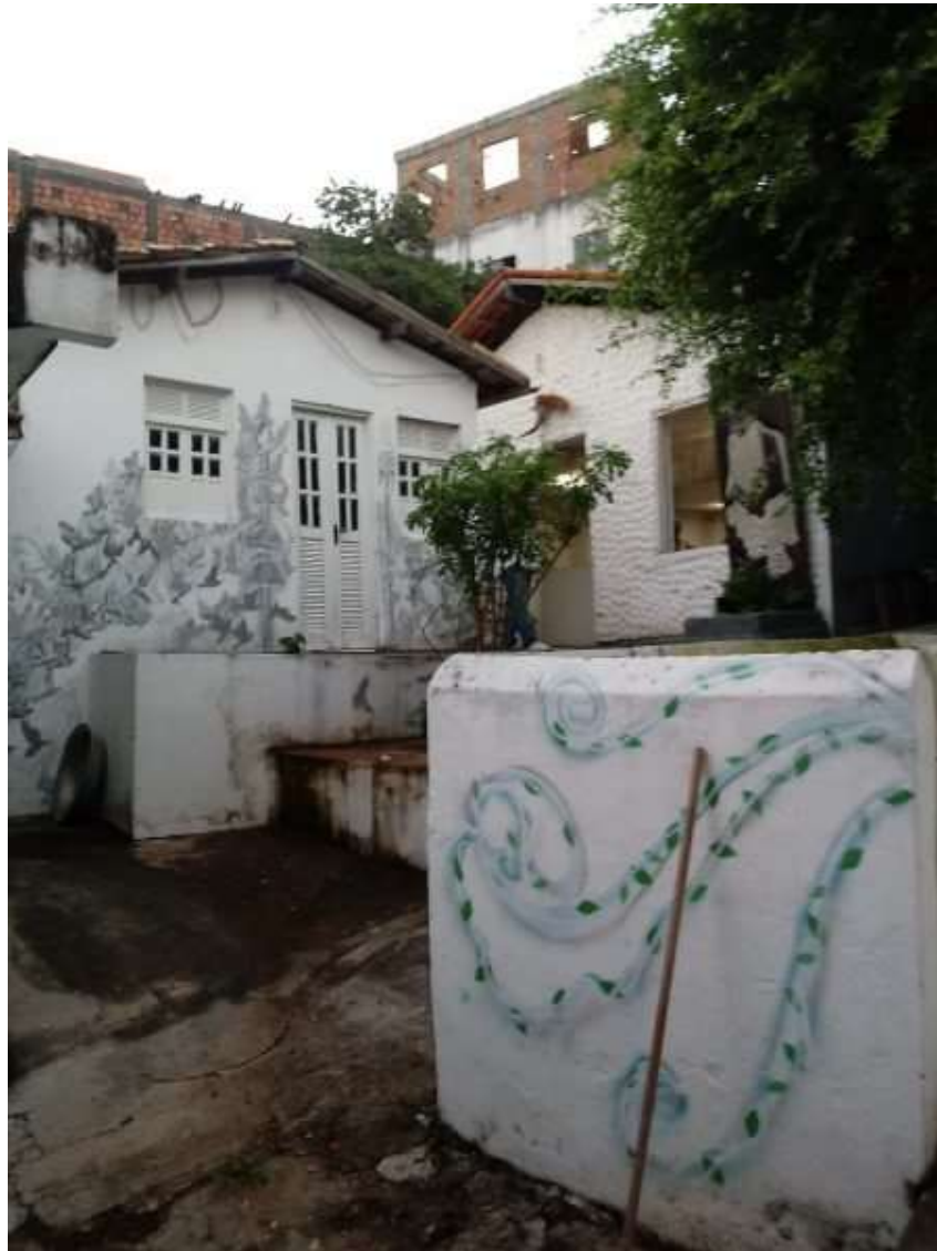
Tumba Junsara cult house in Salvador, BA.