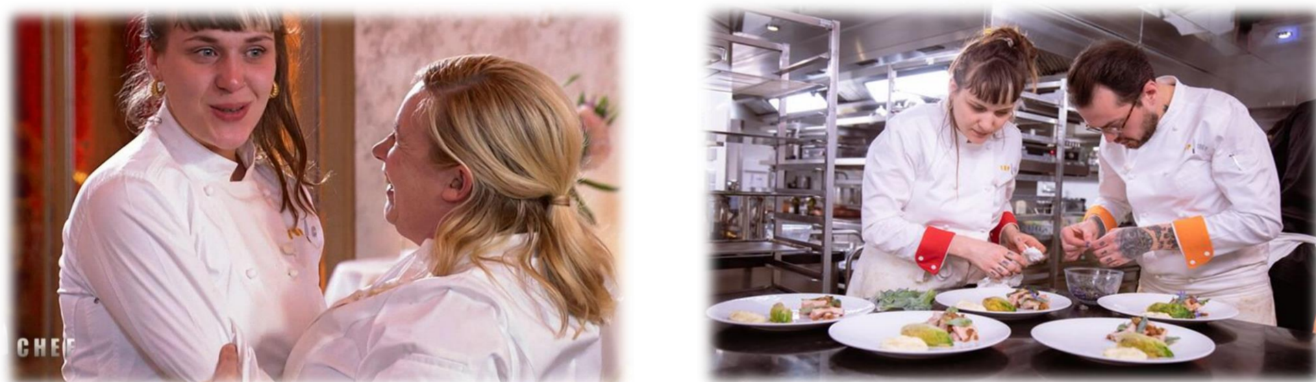
Illustrations of the grand finale (season 13) 2.42 million viewers - 15.5% of the market share (Médiametrie, 2022)