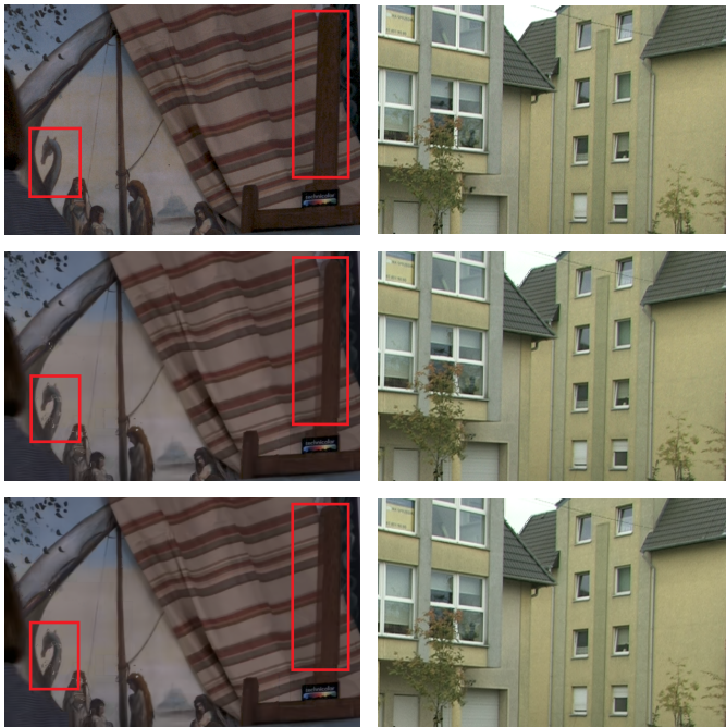
(a) Painting sequence.