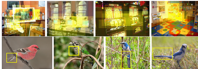
Fig. 3. Heatmap illustrations using test images of classes Artstudio, Computer room, Casino and Kindergarden on top row and most discriminant region used to classify birds test images on second row.

discriminative regions are highlighted in yellow. We note that the model focuses on semantically meaningful regions to take its decision. Figure 3 also highlights the most discriminative region used by the model to classify birds species. It is interesting to see that our model finds distinctive characteristics of species to recognize them: the long tail of the Florida Jay or the grainy appearance of the Spotted Catbird's chest.