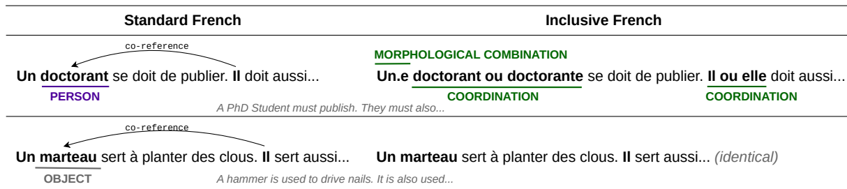
Figure 1: Overview of our research problem and proposed solution: while translating from Standard to Inclusive French requires semantically-heavy capacities, such as knowing which nouns refers to a person or an object, or resolving co-references, the two main processes of Inclusive French, morphological combination and coordination, can be easily detected with a regular expression and a syntactic parser, respectively. Gender-marking words are printed in bold.

This reasonably large dataset enables further studies on Inclusive French translation, e.g., on the importance of vocabulary and tokenization, and comes with a rule-based system that can be readily applied to larger French corpora and could be extended to other languages 8 . Fabien.ne BARThez could be used directly by interested users. In NLP, it could also be applied either as pre-processing (e.g., when translating “ un.e doctorant.e se doit de publier ” to English, or post-processing (e.g., “French Ph.D. students are under-paid” may be translated either to Standard or Inclusive French depending on the user’s preference).