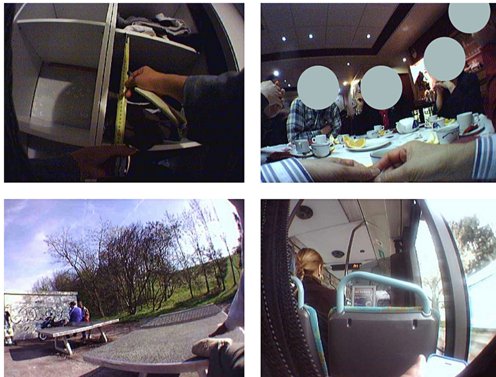
FIGURE 2 Examples of pictures taken by the participants using SenseCam.