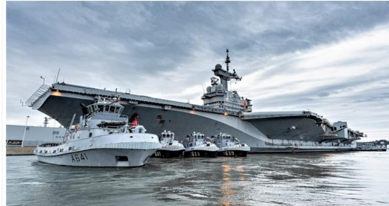
French Carrier Charles De Gaulle Heading Home Amid Suspicion Of Covid-19 The French Navy (Marine Nationale) aircraft carrier and flag ship Charles de Gaulle is heading home early following suspicion of several Covid-19 cases among its crew members.

The COVID-19 epidemic highlighted the weaknesses of civil and naval vessels to overcome the propagation of infectious diseases on board, which impacts the availability of forces .