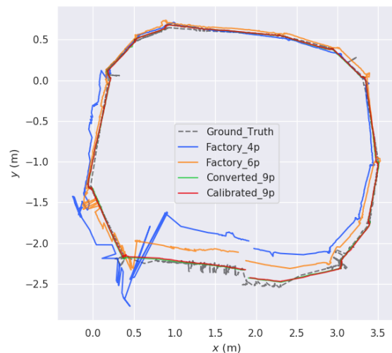
Fig. 3: Camera trajectories estimated with StellaVSLAM using the Azure Kinect (mode NFOV-Binned-15Hz ) for the four sets of intrinsic parameters. The trajectories are aligned and scaled to the motion capture system. The trajectory is plotted using the EVO python package [27].

This paper has formulated several state-of-the-art projection models in a unified notation. It also presents an efficient methodology and mathematical developments for converting camera models for three conversions involving three different camera types. Experimental results obtained with calibration datasets and visual SLAM confirm the efficiency and interest of these conversions, enabling to avoid camera recalibration when this is not possible or difficult.