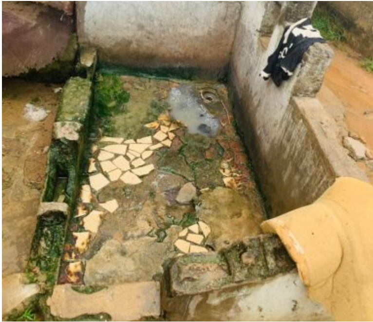
Figure 7: A shower in Abidjan (GEPALEF, 2021)