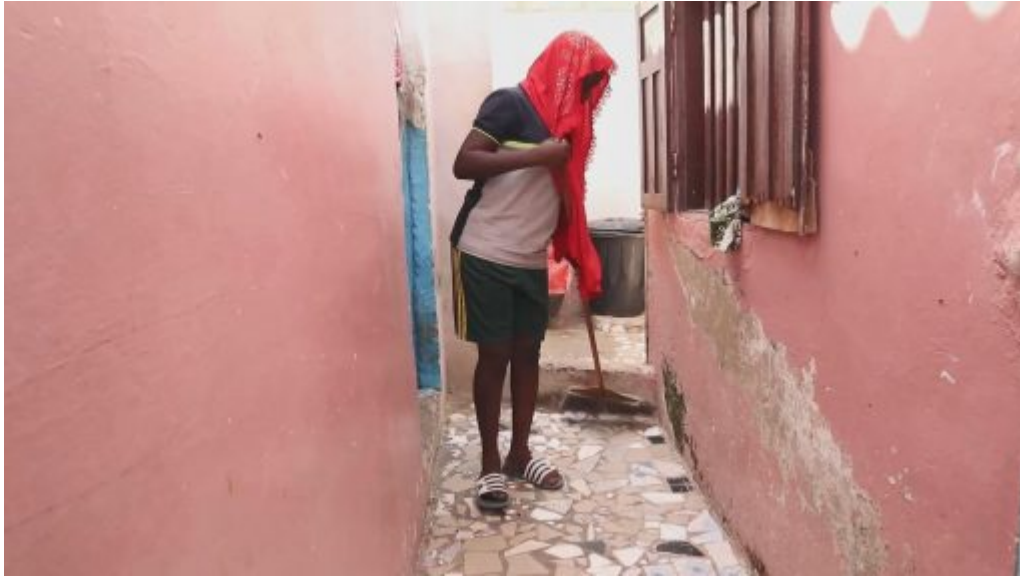
Figure 3 : Women and girls are key sanitation providers yet their needs, including menstrual, are sidelined (OGDS, 2021)

countering with a short play illustrating what a caring and non-stigmatising handling of girls' first periods in school might look like.