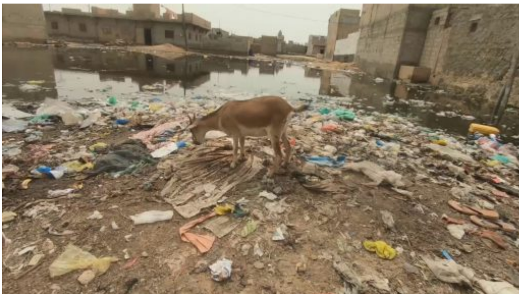
Figure 5 : Women should be celebrated for their sanitation work not blamed for deficient infrastructure and services (OGDS, 2021)