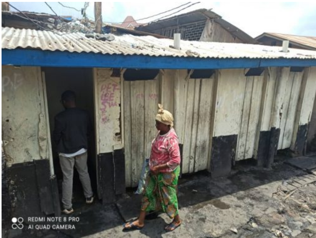
Figure 1: Nyawera Market public toilets, Bukavu, DRC

Above all, the women interviewed described the non-recognition of their contributions to sanitation from families and communities, but also from politicians and public authorities.