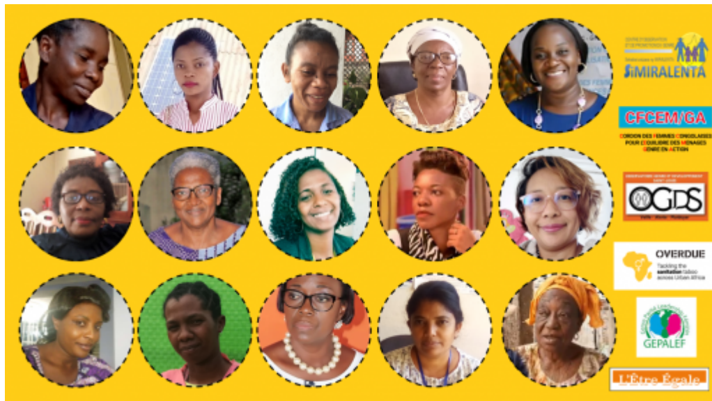
Figure 10: Women speaking up to make toilets seats of gender equality!

Collective demands on sanitation issues revolve more around the issue of access to water. Toilets , symbols of (still taboo) bodily needs and intimacy, are struggling to find their place in community advocacy , with an impact that weighs even more heavily on women and girls. However, women are mobilised in the struggle , as in Saint-Louis, but everything remains to be done!