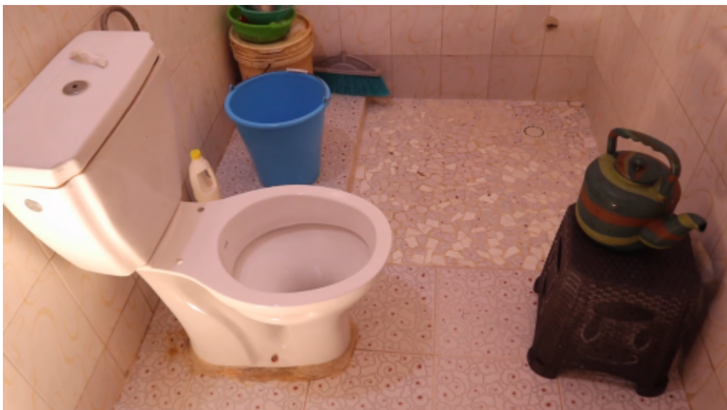
Figure 9: Relieving oneself, changing, washing, checking one’s outfit ... toilets are used for multiple purposes (OGDS, 2021)

Mixed toilets also encourage sexual assault. Women are encouraged to go to school and to attain higher education degrees, but the infrastructure and buildings are not adapting to their bodily needs . In schools, says Anjara Maharavo from the urban commune of Antananarivo, the issue of mixed toilets is starting to be taken into account .