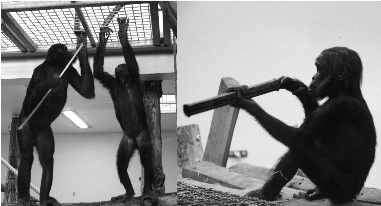
Figure 1. Uni and bimanual manipulations of tubes filled with cooked rice (enrichment devices), at the ceiling grid (left) and on a platform (right).