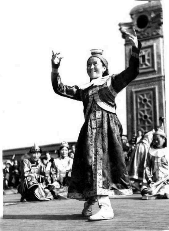
Figure 3. The prima ballerina Alimahüü Jam"yan performing a choreographed version of Dörvöd biyelgee with bowls at the 1 st World Festival of Youth and Students in Prague in 1947