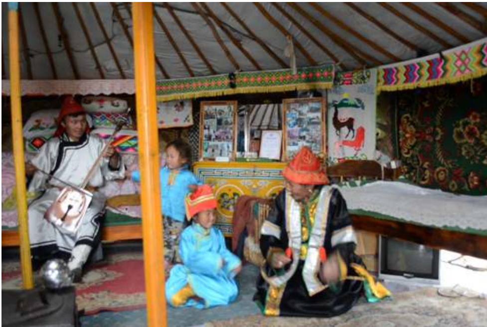
Figure 2. A Hoton family performing bii biyelgèè and its mimetic gestures under the yurt