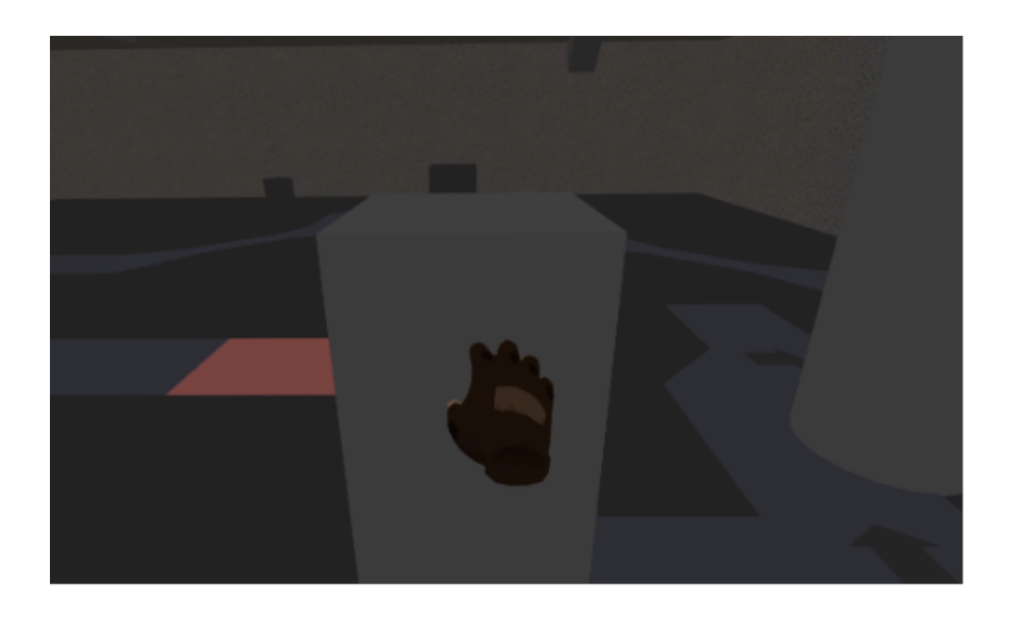
Fig.\ 2.\ Screenshot\ of\ the\ virtual\ mobility\ test\ from\ the\ patient\ point\ of\ view.