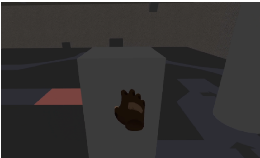
Fig. 2. Screenshot of the virtual mobility test from the patient point of view.