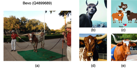
Fig. 3: Generated images for Bevo . (a) Ground truth from Wikidata. (b) Basic label. (c) Plain triples. (d) Verbalised triples. (e) DBpedia abstracts.

Two different evaluations are used to evaluate the characteristics of generated images, and how are they related to the types of prompts, as shown in Fig. 2.