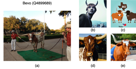
Fig. 3: Generated images for Bevo . (a) Ground truth from Wikidata. (b) Basic label. (c) Plain triples. (d) Verbalised triples. (e) DBpedia abstracts.

Two different evaluations are used to evaluate the characteristics of generated images, and how are they related to the types of prompts, as shown in Fig. 2.