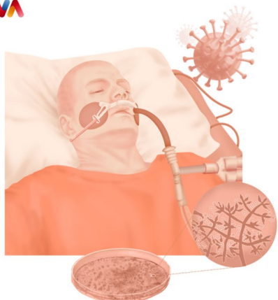
COVID-19 associated pulmonary aspergillosis (CAPA)