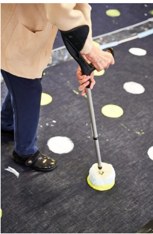
Figure 5. Photographs of the first "bal-peinture" at the retirement home, Nîmes, 2021© Thomas Heydon.

The ephemeral durability of the design projects is an essential factor in experimental practices. Anne-Marie Lecoq, when talking about ephemeral architecture, points out two elements to the analysis of the effects of this factor. On one hand, it lies in "the absence of imperatives of robustness, hence the choice of perishable materials and specific construction techniques" [35] (p. 437). By using materials and techniques of simple construction, this first aspect allows practitioners to share their expertise with the people on the construction sites, from a participatory perspective. The structures of the mobile third place are, for