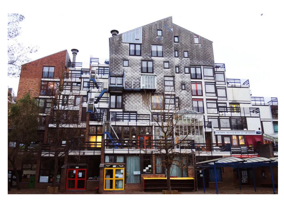
Figure 2. Photography of La mémé—medical faculty housing of Simone and Lucien Kroll, Louvain-la-Neuve, Belgium© Estelle Sauvaitre.