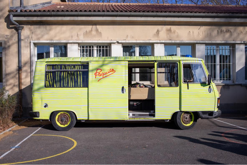
Figure 6. Cont.