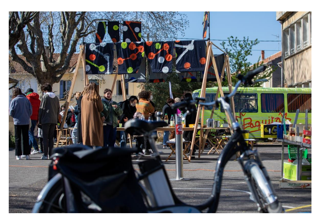
Figure 6. Opening of "Paquita" the mobile third place of the Centre for Gerontology of Nîmes, Market of Beausoleil, Nîmes, 2021© Thomas Heydon.

During the participatory project, the practitioners defend the idea that the ephemeral can be a token of durability or longevity. Without duplicity, this affirmation advocates for reversible works, "mutable" [36], that, given the complexity of contexts, appear to them as more sustainable than the quest for infinite duration that is pinned to the architectural discipline. They engage in their activities with the awareness of not knowing, or at least, not knowing enough about the challenges they face. Those practitioners are more preoccupied by what is taking place and the processes involved.