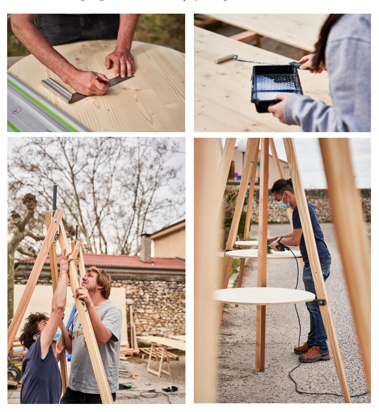
Figure 3. Photographs of the first week of construction in the retirement home, construction of totems in wooden cleats with the students Nîmes, 2021© Thomas Heydon.

The experimental nature of the participatory construction site is clearly assumed and even claimed by the observed practitioners. Their activities show more of a discovery than an affirmation, more of an experimentation than a programming. This induces in projects a specific relation to time, more ephemeral than in conventional projects. They even transform the status of the work, by not producing architectural or design projects in the strict sense, but "events that are built for the time of action to reveal potential usages and to raise awareness in residents on the definition of their living environment [34] (p. 56). The short temporality seems to allow trial and error (preferred method of design) all while giving a festive character to projects (Figure 6).