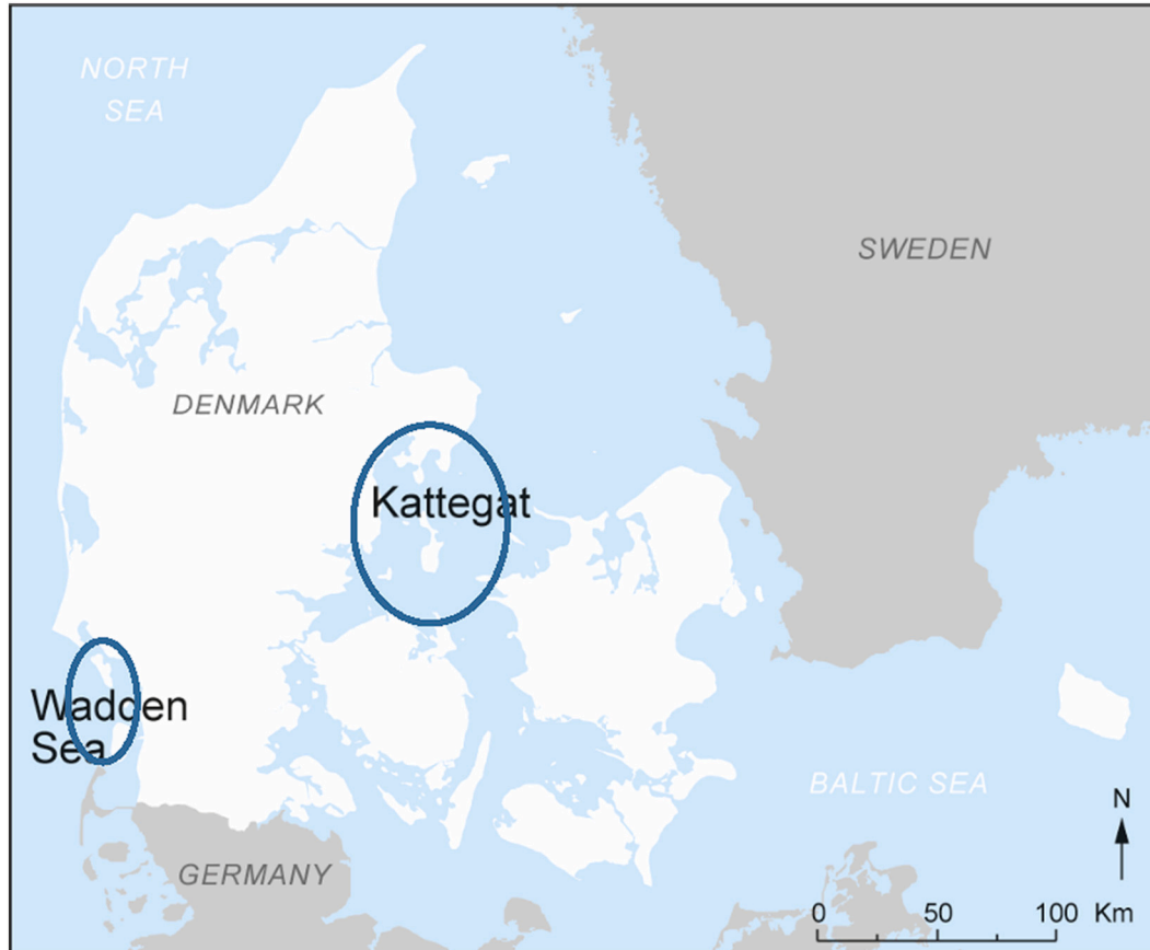
Fig. 1. Map showing Denmark with the two regions, Kattegat and the Wadden Sea, where eiders were sampled.

We used linear ANOVA models with GLM procedure to analyze diet of eiders in relation to period, region and body condition. Pearson correlation analysis was used to estimate the relationship between food items. The following analyses were performed to investigate hypotheses