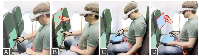
Figure 3: Using passive haptics surfaces in planes for interaction in [14]. (A) shows how the seat-back in front can be used as a passive haptic surface; (B) using translation remapping to create a more comfortable experience; (C) shows the use of a horizontal tray table for passive haptic input; and (D) using translational and rotational remapping for a more comfortable interaction.

However, not all productivity tasks rely on planar 2D displays or content, with e.g. 3D manipulations a common component of a breadth of productivity, from sensemaking tasks [6] to collaborative tasks involving selection and manipulation [2, 3, 15, 21]. Consequently,