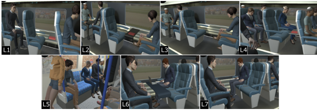
Figure 2: Images illustrating each of the virtual transport seating locations evaluated in [12], absent the AR user/performer (who is present in the empty seat in each location) for clarity. L1 - Single Row; L2 -Single Face-to-face with table; L3 - Single Face-to-face; L4 -Multiple Rows; L5 - Multiple Face-to-face Far; L6 - Multiple face-to-face with table; L7 - Multiple face-to-face.

This social impact was again seen when considering how to interact with AR content. In this paper [12] (see Fig. 2) we examined a range of body-, device-, and environment-based interactions in a mixed reality composite video survey, to explore the extent to which social comfort might vary when interacting with (invisible to other passengers) virtual spatial content. We found that the seating arrangements, and consequent exposure of actions to other passengers, significantly impacted the perceived social comfort of evaluated interaction techniques. In particular, respondents were uncomfortable with highly visible techniques and those with a high potential for encroachment into others personal space (e.g. mid-air interactions) - again demonstrating that the social pressure of the context can lead prospective XR users to optimize for social comfort over their capability to interact with immersive or spatial content.