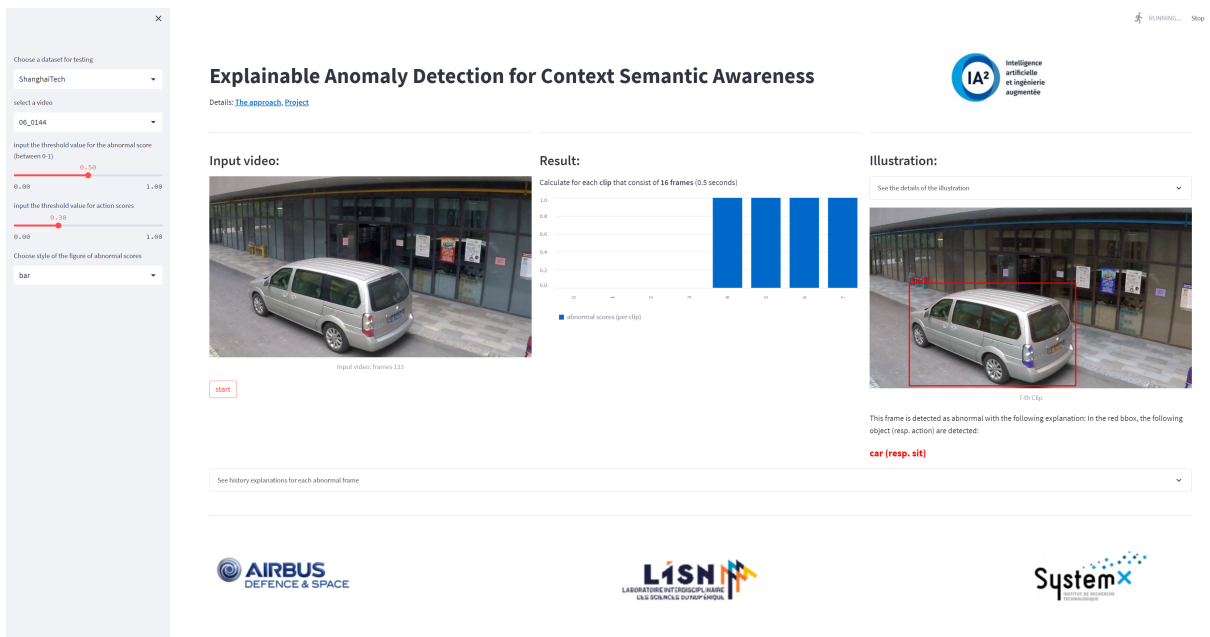
Figure 1: Interface of the web application for the demonstration.