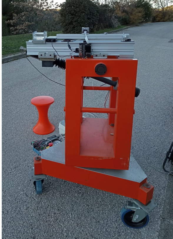
Figure 2: Motorized rotative mount supporting the optical sensor during outdoor experiments.

Finally, methods for processing this type of images (Fig. 1) to estimate heading based on a convolutional neural network training with will also be discussed.