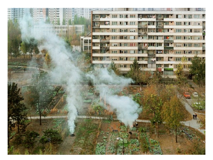
FIGURE 2. Urban gardens in Drumul Taberei, Bucharest, 1984.