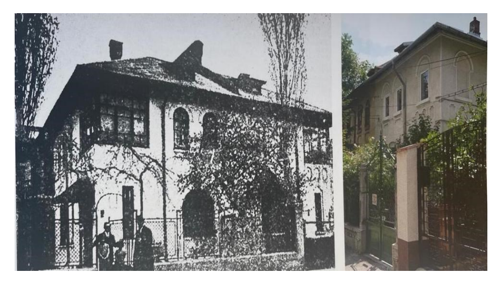
FIGURE 1. House type C, Clucerului street, Bucharest, part of the first plot of the Company [7]

This type of development can be framed in the culturalist model, resulting in a hybrid housing, located at the interference between urban and rural, which had hygienic purposes, the application of the principles of the city-garden and the use of neo-Romanian architectural style. Thus, the plots planned by the Communal Society, between 1911 and 1916 were not uniform or monotonous, although they contained standard dwellings, and were built with quality materials and equipped with public facilities [7].