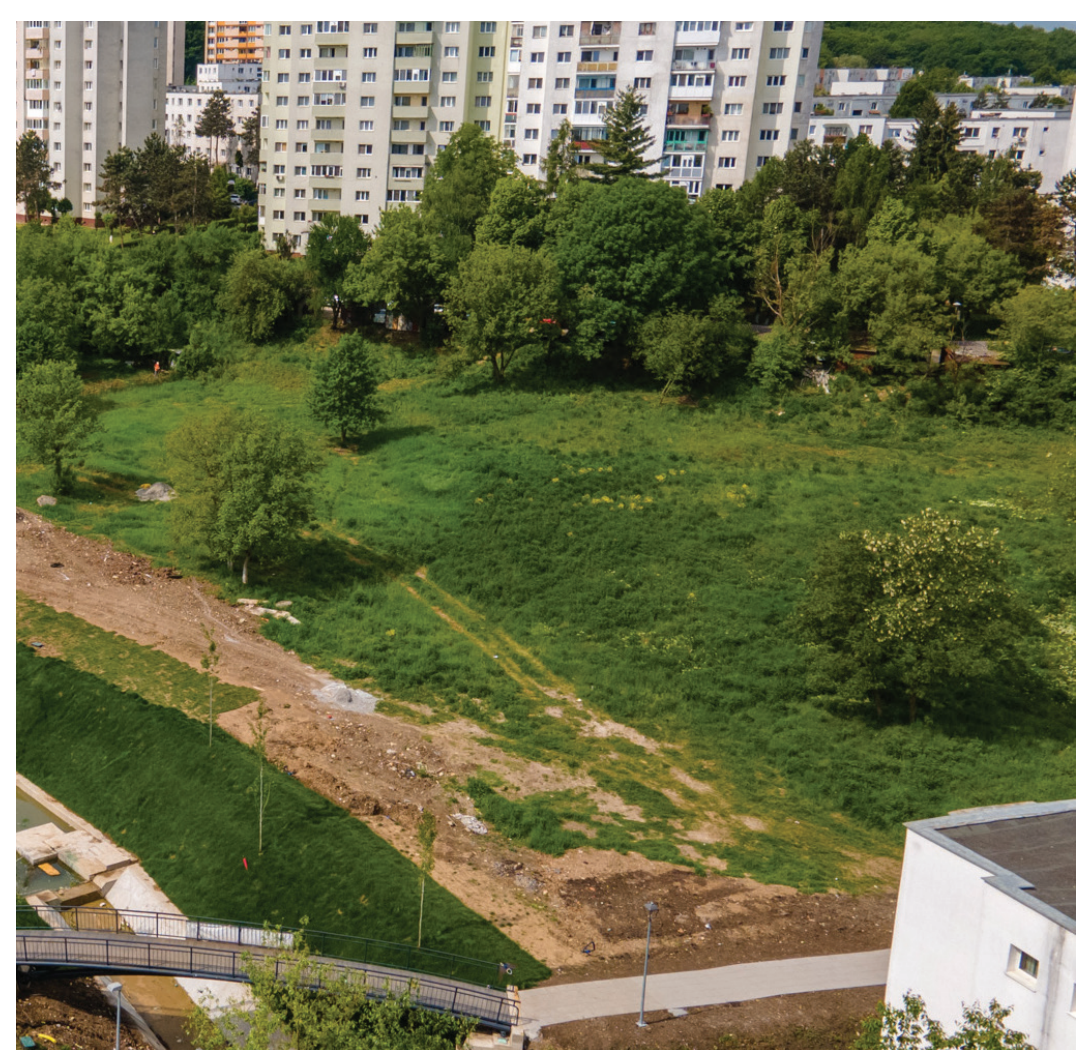
Fig. 7: The amphitheater built as a permanent infrastructure, the landscape design of the stream, and the remaining community gardens next to the blocks on Parâng street. Photo taken in 2022.

In this sense, "La Terenuri" is an example that this integration is possible, even if the success was partial. The project showed how temporary practices and urban commons can adapt to current lifestyles and aesthetics of the city, how visions for the city can become more democratic, and how decision-making can be shared among residents, politicians, planners and urban activists.