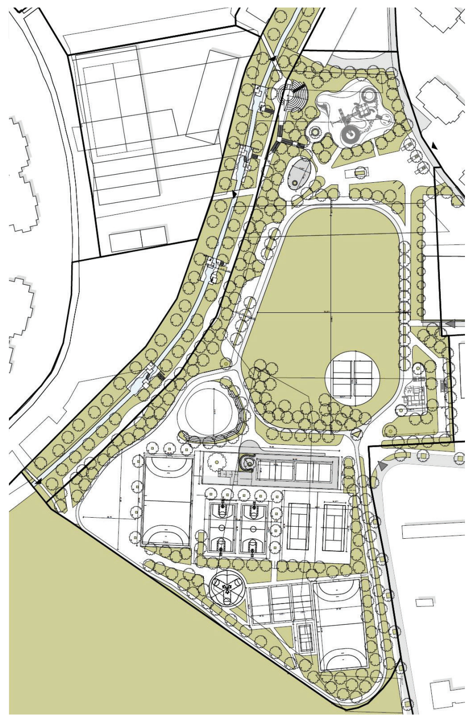
Fig. 6: Final plan of the sport base project.