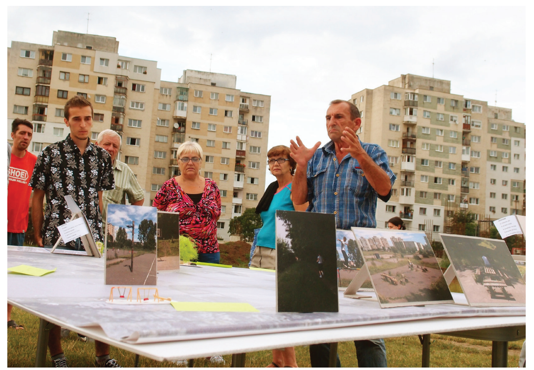
Fig. 2: Inhabitants from "La Terenuri" area giving feedback on the Participatory Scale Model. opposite page:

Fig. 3: Neighbors Arena used as a meeting place.