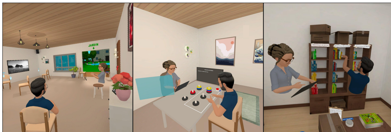
Figure 3. The clinic is composed of various environments. From left to right: Waiting room with different chairs and waiting activities, the female practitioner welcomes the patient; Consultation room with a desk-based activity (here a version of the Tower of London test); Both users in a standalone activity environment (here Shelves that we developed for executive function testing, see Ribeiro et al. (2024)).

We can now rapidly describe the various environments we have developed (Fig. 3). The waiting room is an environment that allows the user to teleport from chair to chair (or bench when outside in the garden) and carry out waiting activities. Amongst the ones we have designed with the medical members of our team, we implemented the following: an activity for controlling one's respiration; another for consulting medical information and newspapers on a table; a contemplation activity with large scale images accompanied with sound; and a gardening stand where patients can select and plant flowers creatively. The consultation room features a desk, where the practitioner has access to a control panel and several screens, one of them for sharing information with the patient. The control panel allows to launch tests, control their unfolding and access the resulting data. In our prototype we have implemented a fully functional version of the "Tower of London" test. Lastly, both the patient (by standing and moving) and the practitioner (staying in the chair) can go into standalone tests environments , where the patient carries out the activity while the practitioner controls and observes the task, getting information on the control tablet.