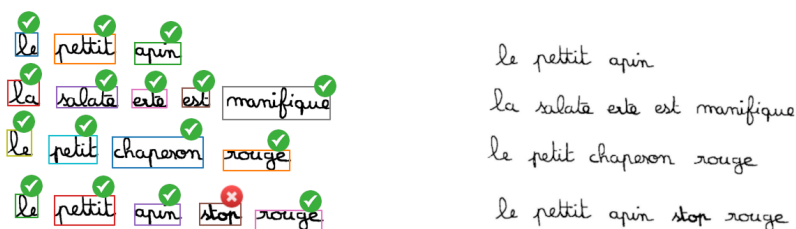
Fig. 9 Study's system accepted and rejected words visualization.

In order to avoid providing incorrect spelling feedback to the child during dictation, the rejection of unrecognized words is crucial. When no recognition occurs (due to an inadequate recognition score from the proposed word to the BLSTM-CTC model), or when alignment between the ASCII transcriptions of recognized items and those of the dictated words is unachievable, the decision is made to reject the word currently being processed. This is the case for the word 'stop,' which gets rejected and for which no feedback will be given to the children. The implementation of rejection leads to a 6.5% enhancement in the system's word recognition rate (compared to our previous best results in [3]), thereby providing a more precise feedback to the child. Please refer to Figure 9 for visualization.