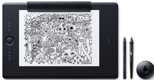
Fig. 2 Wacom Intuos Pro Paper edition (Stylus and Wacom pencil) [7].

The Wacom Intuos tablet consists of a slate surface and a stylus/pen for interaction. To draw using this tablet without attaching a sheet of paper, the user must use the stylus and software for drawing on an external computer to visualize and track the stylus's position and rendering. To draw on paper, a sheet of paper can be attached to the slate's surface, and drawing can be done directly using a Wacom pencil pen (Figure 2).