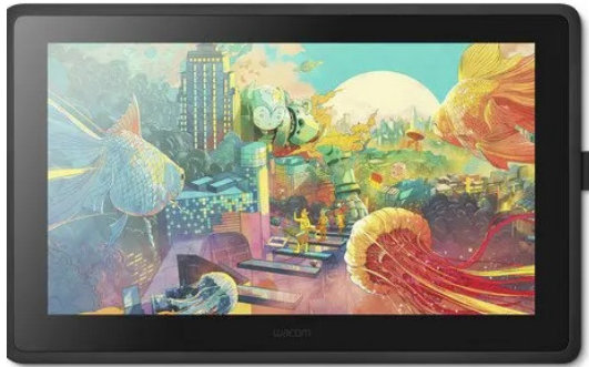
Fig. 1 Wacom Cintiq Tablet [7].

Although drawing tablets with digital screens and styluses are highly developed, they are more geared towards professional artists rather than children's handwriting recognition and spelling learning (Figure 1).