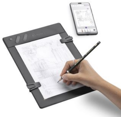
Fig. 3 ISKN Repaper Tablet [1].

The ISKN tablet comprises a slate area where an A5-sized sheet of paper can be attached. It utilizes a standard pen (such as a pencil, felt-tip, or ball-point pen) for drawing. The pen interacts with the tablet slate using a magnetic ring attached to it, without requiring a battery or electronics (Figure 3).