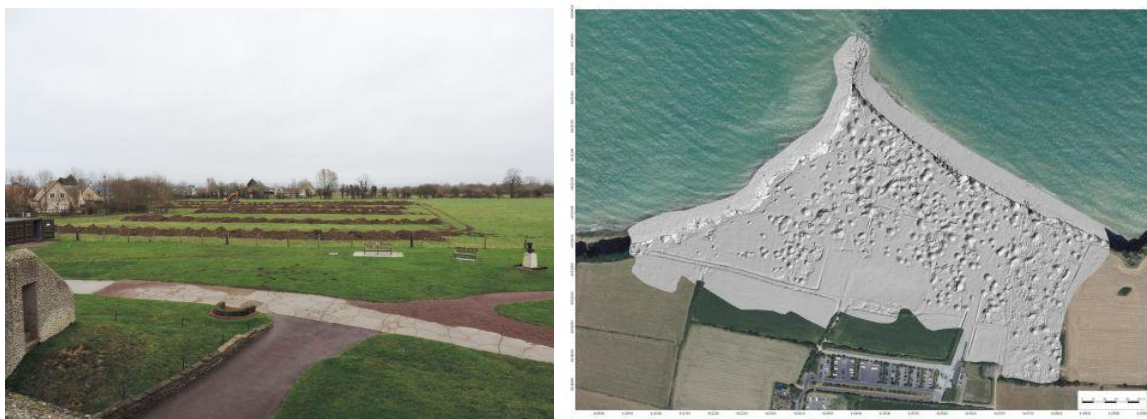
Figure 9 (left): Merville-Franceville-Plage, Calvados, Normandy. Trenches opened during an archaeological survey near the bunkers of one of the best-known Atlantic Wall batteries in Normandy. An unknown gun-position was found in this part of the complex, outside the extent of the museum