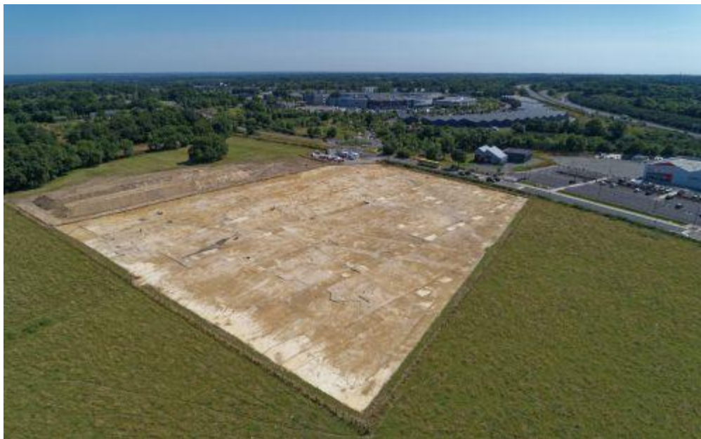
Figure 15: Savenay, Loire-Atlantique, Pays de la Loire. The excavation area of the camp of La Touchelais. Founded during the Great War by US Expeditionary Forces, it became a 'Frontstalag' for the internment of French colonial soldiers between 1940-1944