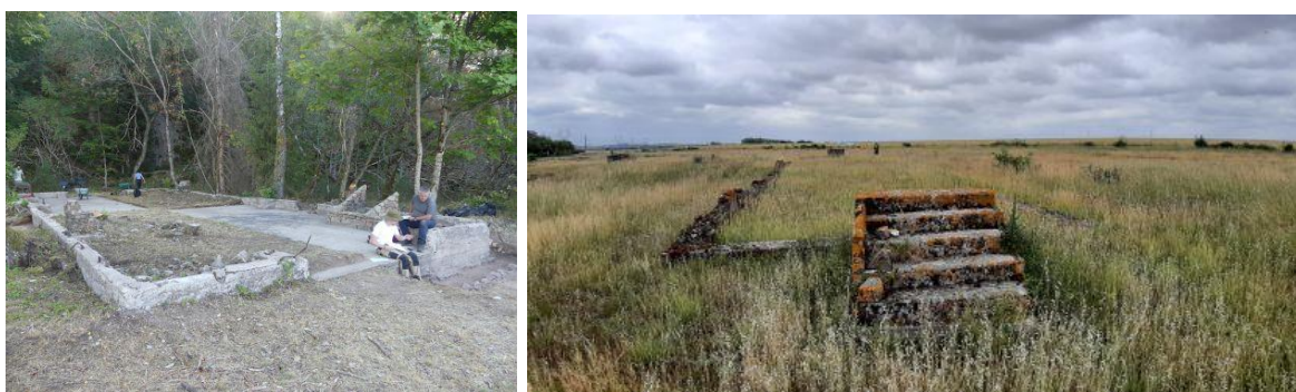
Figure 13 (left): KL Natzweiler-Struthof, Natzwiller, Bas-Rhin, Communauté européenne d'Alsace. The 2022 excavation team working on one of the industrial buildings in the quarry