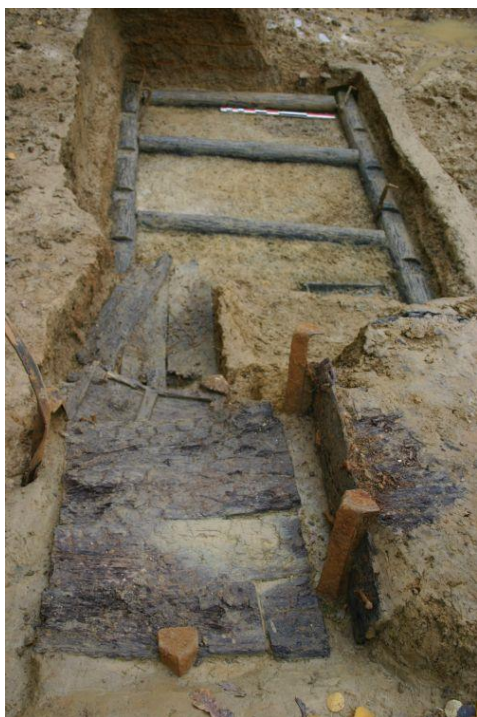
Figure 1: Touffréville, Calvados, Normandy. German dugout in 'Eastern front style', the first foxhole excavated in Normandy