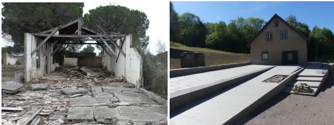
Figure 11 (left): Rivesaltes, Pyrénées-Orientales, Occitany. One of the ruined barracks of the camp, before the foundation of the memorial in 2015 Figure 12 (right): KL Natzweiler-Struthof, Natzwiller, Bas-Rhin, Communauté européenne d'Alsace. The new memorial of the gas-chamber built after the archaeological surveys, Summer 2022