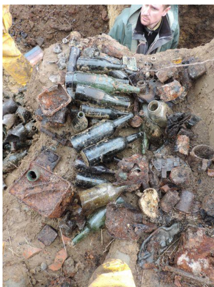
Figure 16: Langrune-sur-Mer, Calvados, Normandy. Excavation of a deep German dugout into which the soldiers of 48 Royal Marines Commando buried and burnt their waste after the bitter fighting of 6-7 June 1944. Among the various objects were dozens of English beer and other alcohol bottles.

There is little doubt that this still-nascent research will give rise to many developments in the coming decades that we, French archaeologists, ought to share with the largest international public and scientific community.