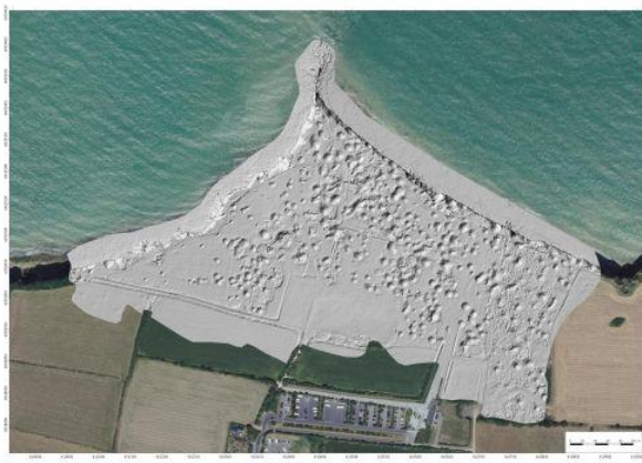
Figure 9 (left): Merville-Franceville-Plage, Calvados, Normandy. Trenches opened during an archaeological survey near the bunkers of one of the best-known Atlantic Wall batteries in Normandy. An unknown gun-position was found in this part of the complex, outside the extent of the museum