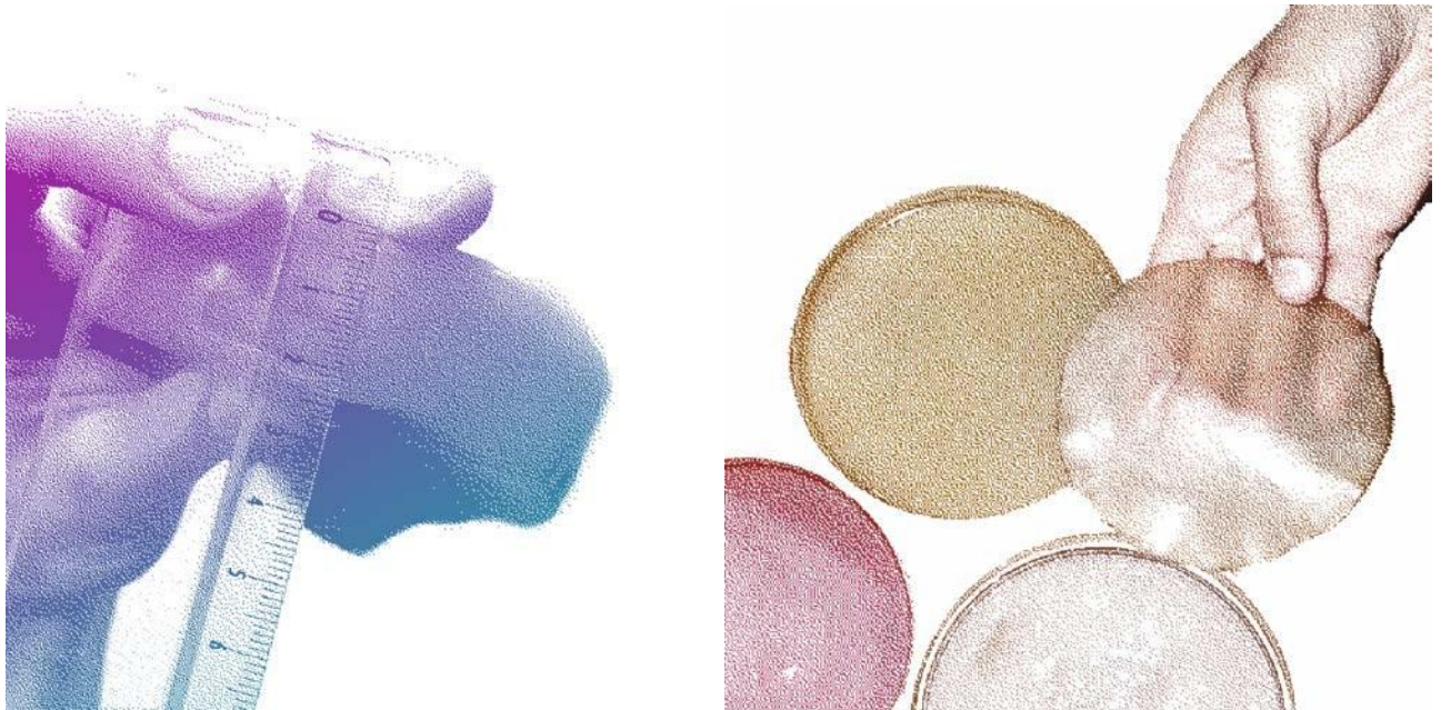
Figure 5 . Measuring the thickness of home grown kombucha bacterial cellulose before drying.

Following kombucha, I met artists with design backgrounds, an interest in food, ecological and/or political awareness, makers of ritualistic forms as social sculpture, inspired by ecofeminists' fictional tactics, and critical, and speculative design methods. This mixture of styles relates to kombucha itself: its plurality of micro-population and the plurality of the ways humans may look at it: as a tasty and/or healthy beverage, as a metaphoric form to re-think human relationship to living being, as a biomaterial with uses still to be explored or stabilised.