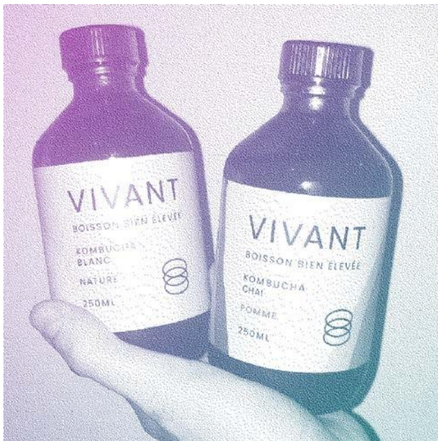
Figure 4. Two bottles of kombucha soda from the French brand Vivant Kombucha.

Based in Paris since 2018, the brand Vivant Kombucha, has adopted a marketing positioning in which taste and process are underscored. It is intentional, inherited from natural wine culture (which inspired the fermentation technique) and brewing culture (which inspired the packaging). The project was to create a non-alcoholic beverage with a taste complexity that related to wild fermentation and the natural wine world. [20]