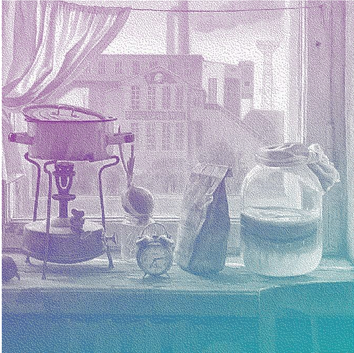
Figure 1. One of the oldest Western representations of kombucha: painting of Philipp Kubarev (Morning, 65x80 cm, 1918). Graphic treatment and colour modification: the author.

The various domains touched by kombucha are concrete places from which to address previous questions —ones that, otherwise, would remain theoretical and unembodied. These domains are: culinary design as it relates to fermentation, textile design, prospective and fictional projects, and art. How do contemporary artists and designers reactivate issues inherited from ecology, feminism or mesology? How might kombucha be involved in these initiatives?