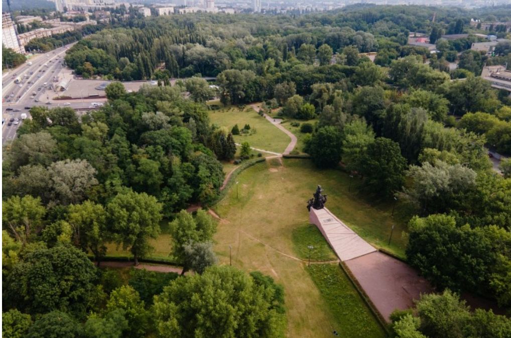
Aerial view of Babi Yar.

long and conflicting history, full of twists and turns, of a memory that has yet to be built on the very site of the crime.