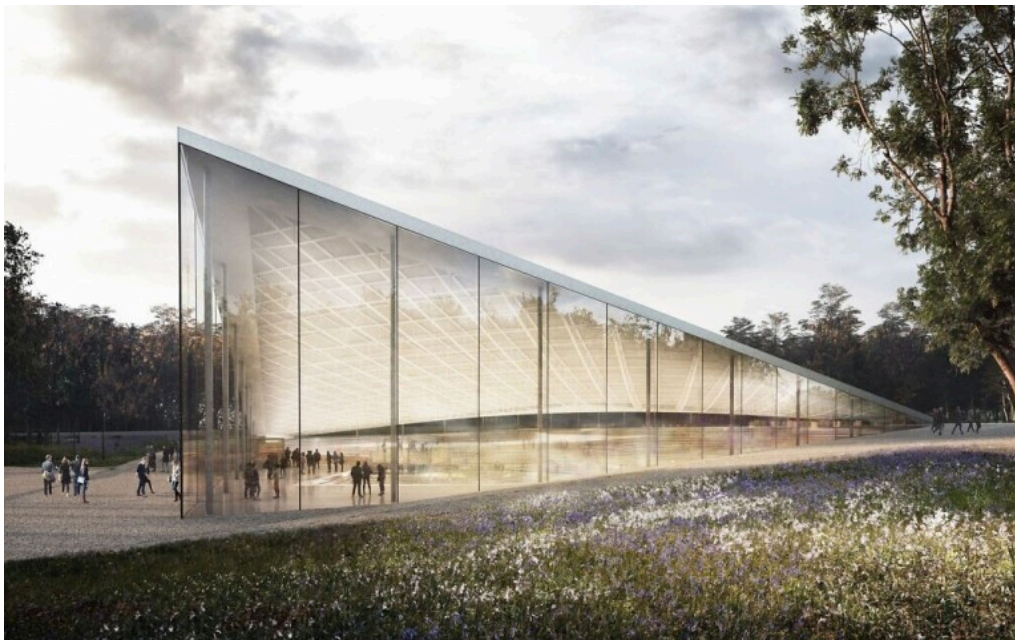
Plans for the Babi Yar Holocaust Memorial Center, as designed for completion in 2026.