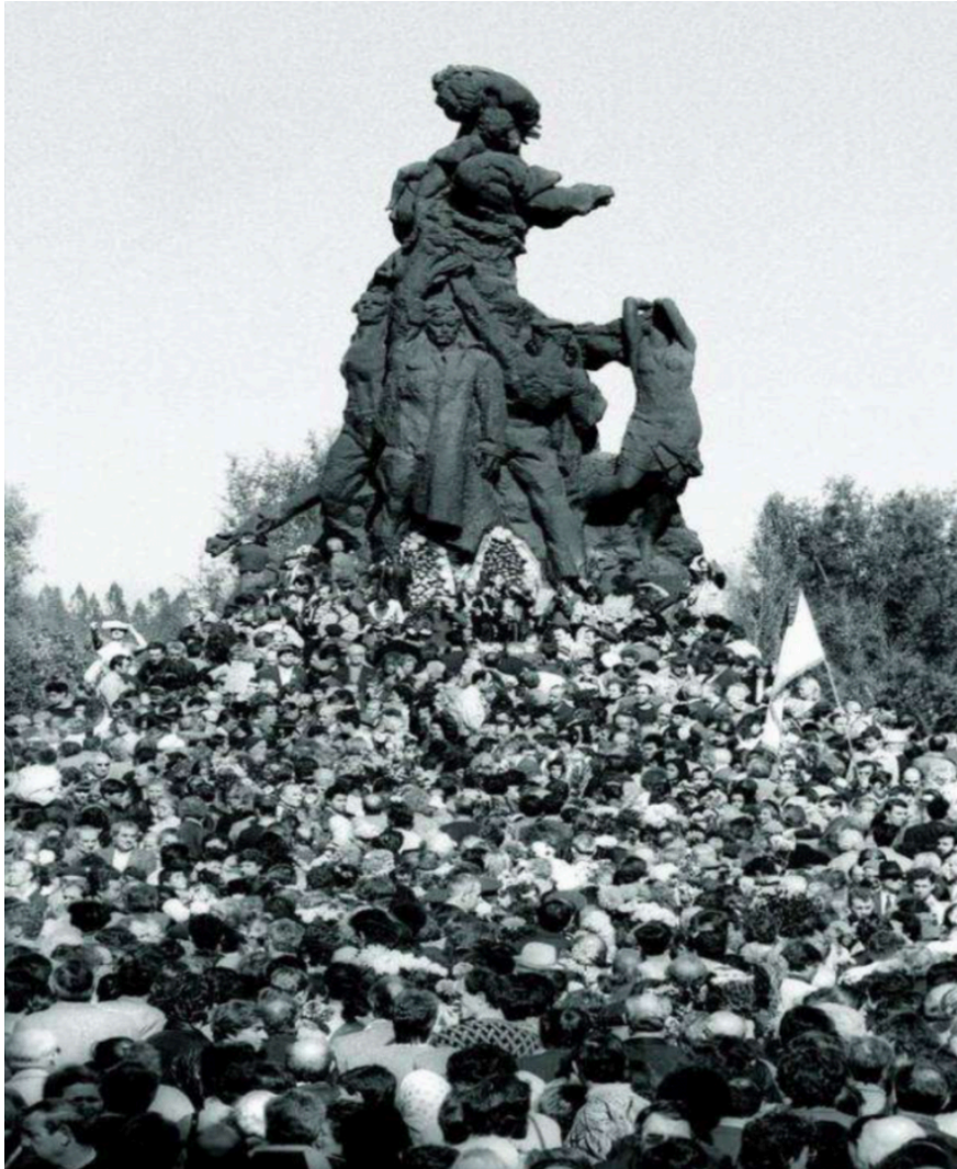
Inauguration on July 2, 1976 of the monument to Soviet citizens and prisoners of war killed at Babi Yar, Kiev.

not those of the executions. The monument to Babi Yar from 1976 is gigantic like the oblivion and error it induces.