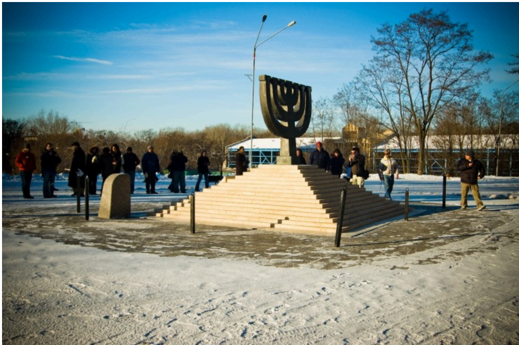
Menorah at the Babi Yar site symbolizing the Jewish identity of the majority of the victims.

and declared that “it is necessary for a people to admit its mistakes and ask for forgiveness” in order to move forward. During this week of commemoration, a bronze Menorah is unveiled [10] inscribing in the memorial landscape of Babi Yar that it was as Jews that old men, women, men, children were murdered. The story could have ended there, but it has continued for thirty years, because today it is a memorial center and a museum that must be built to give a narrative to a place that lacks legibility. But what kind of narrative should be proposed for a place with several facets?