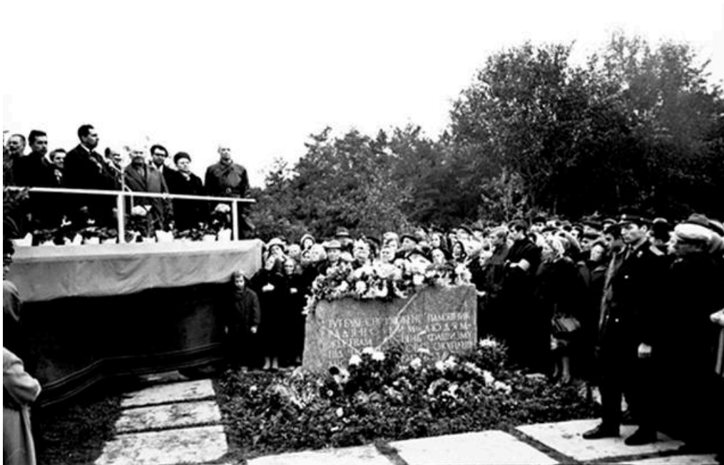
September 1968 rally at Babi Yar, in front of the stone with the barred inscription.