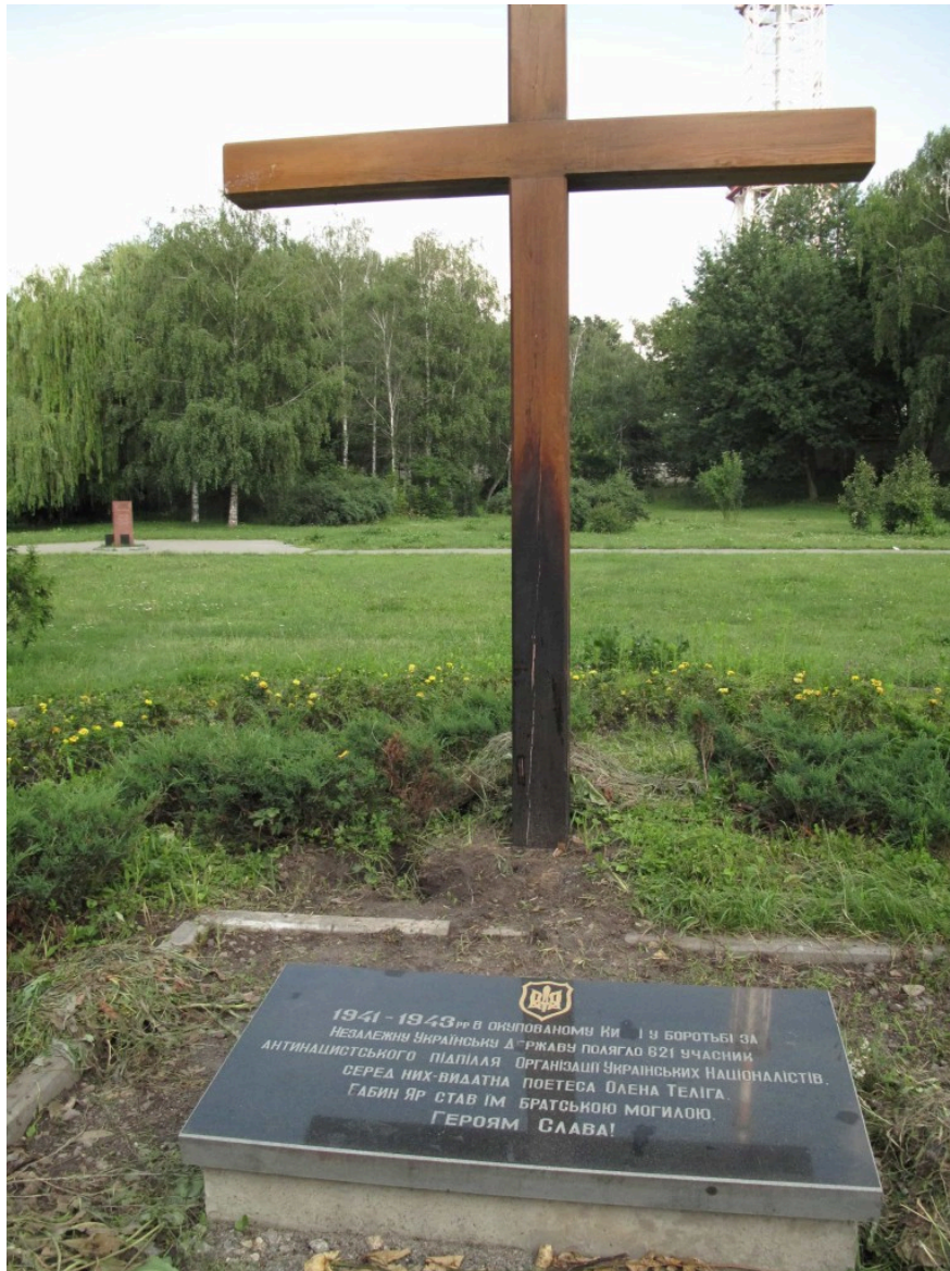
Cross and stele in memory of the 621 members of the Organization of Ukrainian Nationalists, including the poet Olena Teliga.

Even today, in 2021, about thirty distinct monuments litter the territory of Babi Yar. Thirty symbols that certainly allow to get out of the ethnic indifferentiation and typology of crimes, which characterized this place in the Soviet era, but that scatter the memories of the place and do not make it at all intelligible for a visitor. Some of these stones are promises of Holocaust memorial centers that never came into being.