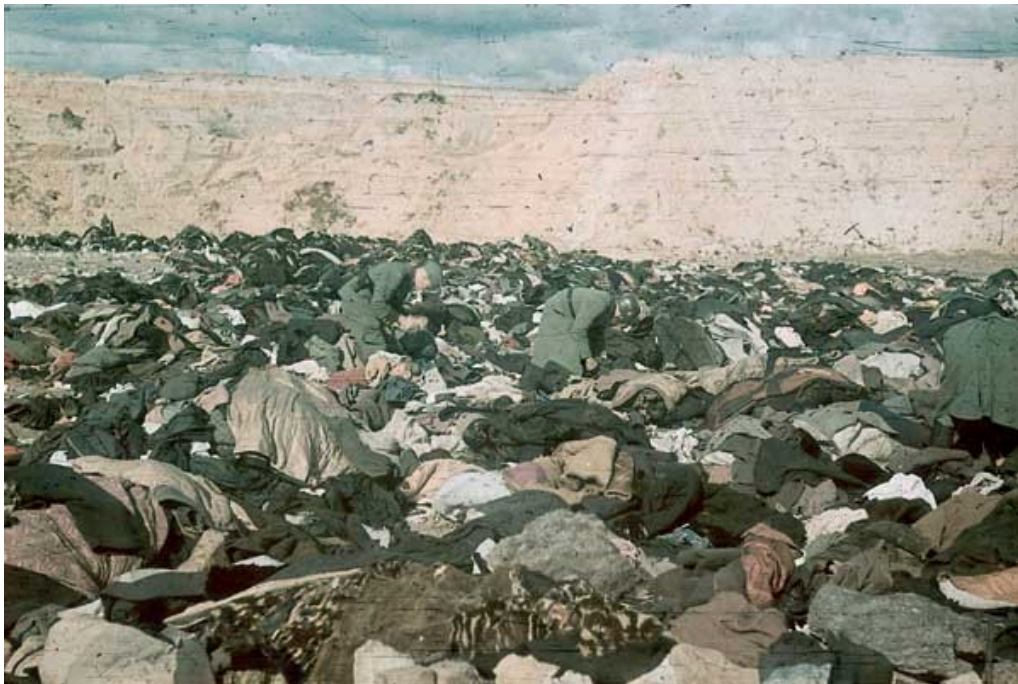
SS men search the belongings of murdered Jews in early October 1941.

Ostarbeiter, patients of a nearby mental hospital. Sometimes killed elsewhere, their remains were thrown into the ravine. Then, after the end of the massacres, in the summer of 1943, the traces of the genocide were partially erased by the Nazis in the framework of Operation 1005, which involved the exhumation and cremation of the bodies.