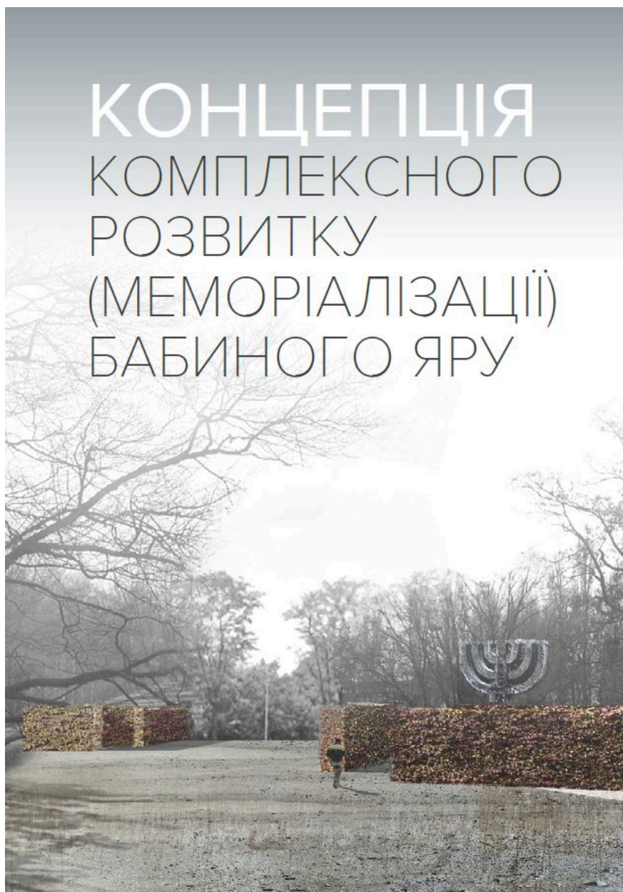
Cover of the booklet presenting the project of memorialization and expansion of the "Babi Yar National Historical-Memorial Reserve", 2021.