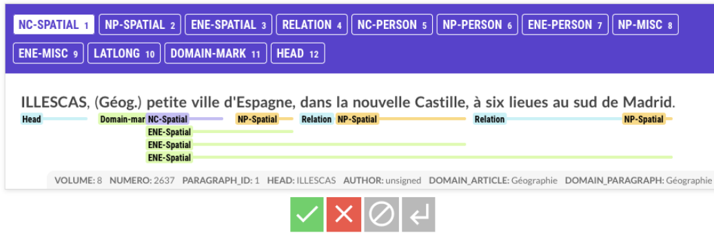
Figure 1: Example of the Prodigy interface for manual validation. Annotators can see basic metadata for the paragraph as well as the options for the spancat tags.

low, an iterative loop was established. In this loop, the trained model predicted annotations on additional paragraphs. Human annotators then interacted with these predictions through the Prodigy interface, correcting and refining the model outputs (see Figure 1). This iterative process progressively refines both the model’s predictive capabilities and the overall dataset quality. By linking the strengths of human expertise with machine learning algorithms, our methodology aims to achieve an effective synergy in the geo-semantic annotation pipeline, ensuring the creation of a robust and accurate gold standard dataset. Through this iterative approach, we continuously evaluate the model’s performance, correcting misclassifications, and reinforcing correct categorizations. This methodology not only contributes to building a gold standard dataset but also simultaneously trains a machine learning model, completing two goals at once.