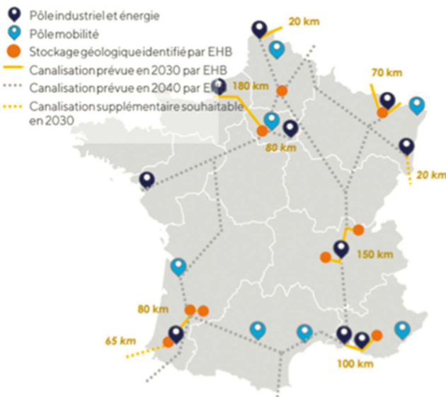
Figure 8 : Étendue du réseau de canalisations de transport de l'hydrogène nécessaire pour raccorder les grands pôles industriels et d'énergie – Source : EU H2 backbone (EHB : European Hydrogen backbone).

Figure 2: a network of hubs connected by pipeline (extract from Bui, 2022).