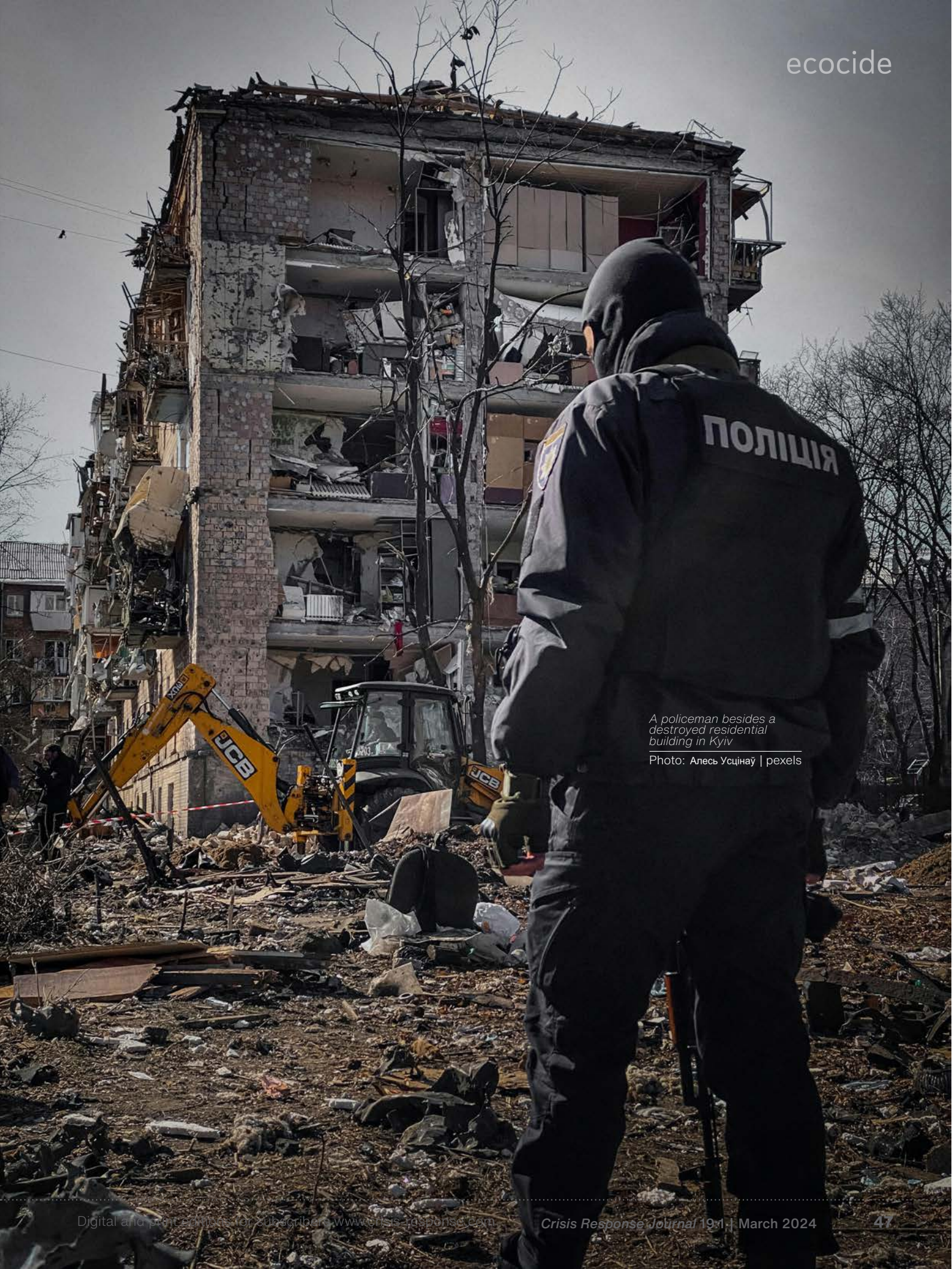
A policeman besides a destroyed residential building in Kyiv