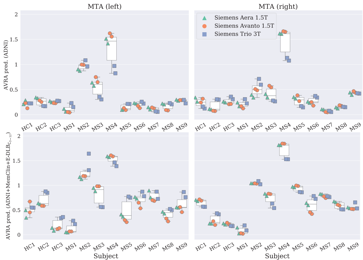
Fig. 3. Boxplot of AVRA's ensemble ratings of left MTA (left column) and right MTA (right column) for all participants in the test-retest dataset. Top row: model trained only on ADNI; Bottom row: model trained on ADNI+AddNeuroMed+MemClin+E-DLBC 3-12 . Each subject was scanned twice with repositioning in three different scanners, and each image's AVRA rating is plotted in different colors depending on scanner. Individuals denoted with the prefix "HC" were healthy controls and "MS" were patients with Multiple Sclerosis.

a degradation of a CNN model when applied to MRI images acquired with protocols not seen during training, which is problematic for scalable deployment in clinics. Similar findings have previously been reported on segmentation tasks on cross-institutional MRI data (Albadawy et al., 2018; Perone et al., 2019) and chest x-ray data (Pooch et al., 2019; Yao et al., 2019). While inter-rater