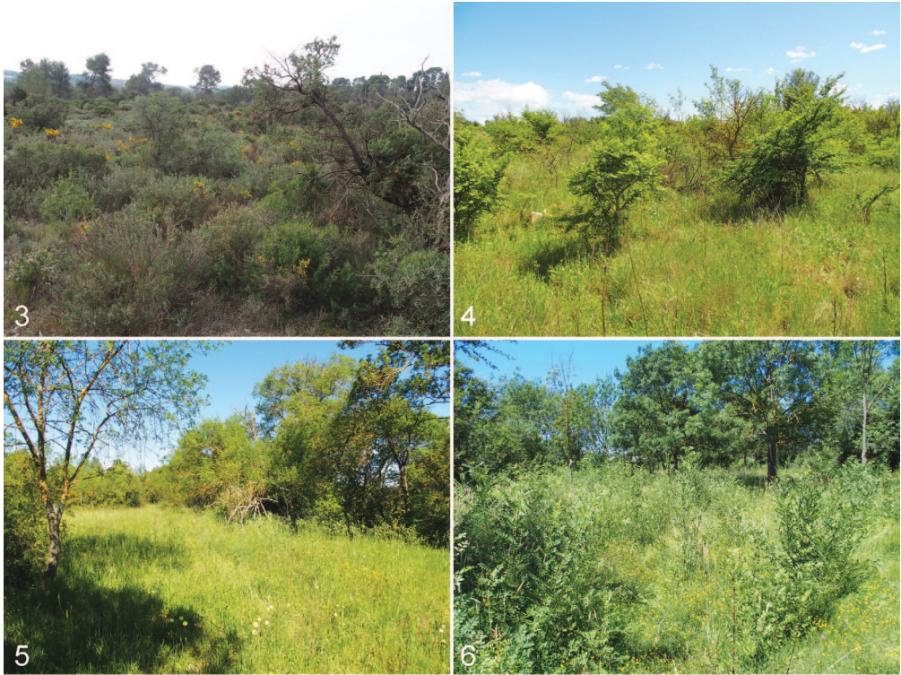
Fig. 3-6. – Habitat of Ptilophorus dufourii (Latreille). – 3 , Garrigue with low vegetation. Males mainly on flight and at the apex of branches and herbs, females on dead branches of Juniperus . France, Hérault, Prades-le-Lez, 43.71815N 3.86088E. – 4 , Wasteland with Ulmus minor Mill., 1768. Males at the apex of herbs, females on dead branches of Ulmus . France, Hérault, Entre-Vignes, 43.6929N 4.09477E. – 5 , Meadow bordered by a riparian forest. Males at the apex of herbs, females on dead branches of Rosa sp. and Fraxinus angustifolia Vahl, 1804. France, Hérault, Sussargues, 43.71258N 3.98623E. – 6 , Wasteland with Fraxinus angustifolia Vahl, 1804. Males at the apex of herbs and branches, females on dead branches of Fraxinus angustifolia . France, Hérault, Lunel-Viel, 43.68654N 4.09583E.

During some field observations, in the morning, when the temperature was colder, both males and females were seen motionless on small branches of trees and shrubs, with their heads tucked against their ventral side (fig. 8).