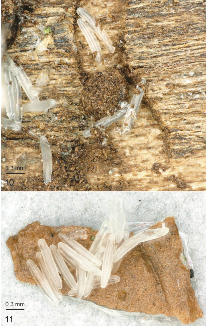
Fig. 10-11. – Eggs of Ptilophorus dufourii (Latreille). – 10 , On a small dead branch, once the bark removed. The trace of a saproxylic insect larva is visible. – 11 , Glued together on a piece of bark.

Distribution. – The distribution area of P. dufourii is circummediterranean, from the Iberian Peninsula to Türkiye, via North Africa (except for Libya and Egypt), and reaches the shores of the Caspian Sea in the east (LOPEZ-COLON, 1997 ; BATELKA, 2007, 2008). There are isolated records of the species as far north as Hungary (SZALÓKI et al. , 2012).