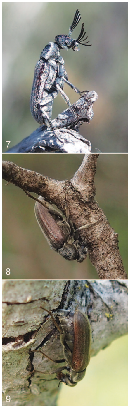
Fig. 7-9. – Ptilophorus dufourii (Latreille). – 7-8, ♂: 7, on a small dead branch, its antennae well expanded; 8, on a small dead branch, motionless, with its head tucked up against the ventral side. – 9, ♀, laying eggs under the bark of a small dead branch of Ulmus minor Mill., 1768.

Only the period of appearance between May and July, given by CAILLOL (1914), differs by one month from all other articles. Among the data collected, only one observation was done in July: two males found by J. Briel in Castries (Hérault), on 3.VII.1952.